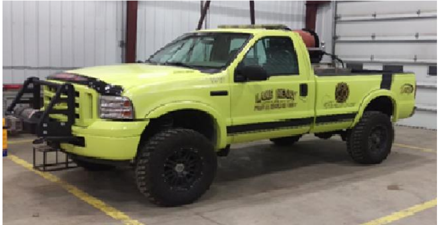
State Surplus Engine - Lake Henry Fire Department

The state-funded Rural Fire Program used federal dollars to purchase ten one-ton trucks from the state fleet program at a reduced price. This approach avoids auction and selling costs and passes the savings onto fire departments. Although these trucks have met the criteria for replacement by fleet managers, they still have service life and can be used as grass trucks to extinguish small fires. The demand by rural fire departments for these units exceeds their availability.