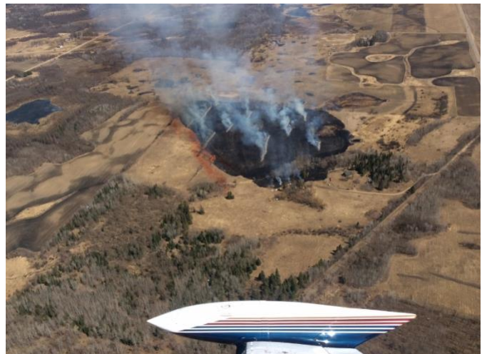
Firewood Fire - Clearwater County

Suppression costs include activities that directly support and enable the DNR to suppress wildfires, including the prepositioning of resources. As fire danger and fire occurrence increase, the resources that must be positioned for immediate response also increase. Presuppression costs were approximately 44 percent, or $10,337,170, of the Direct and Open fire appropriations in FY2018. Suppression costs were approximately 54 percent, or $12,631,206, of the direct and open fire appropriations in FY2018.