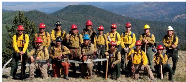
Interagency Fire Crew

In-state fire preparedness for response was about average throughout the fiscal year, so the Minnesota Incident Command System (MNICS) did not mobilize any teams. However, the DNR actively mobilized resources to out-of-state incidents throughout FY2018. In May 2018, national fire activity dramatically increased, resulting in a critical shortage of firefighting resources nationally. The DNR and other MNICS agencies actively mobilized crews, aircraft, and overhead personnel to aid several western states and Canada in fire suppression efforts. These requests are supported through mutual aid agreements, with all costs reimbursed to the state.