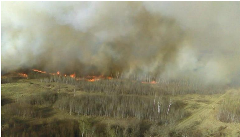
Halma Fire – Kittson County