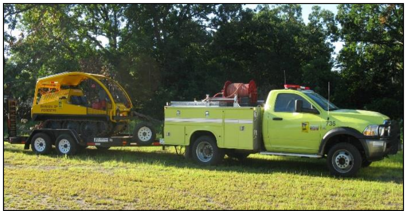
A Service Body engine towing a J-5 tracked vehicle

Many forestry areas use heavy duty, half-ton trucks. These units cost less (both base and operating rates) than larger-sized engines, yet work well as maneuverable initial attack units when equipped with water tanks and pumps. The most common fire vehicle is a one-ton pickup; these trucks haul 300 gallons water. Service-body pickups are 1¼ or 1½ ton pickups, fitted with storage compartments for an assortment of firefighting equipment. The fleet did not expand in 2018. The DNR will replace seven trucks in 2019.