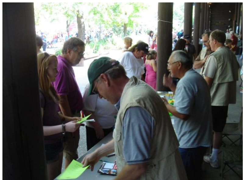
Visitors received fire prevention information at the Minnesota State Fair

On the third week in April, the state observes Wildfire Prevention Week. This