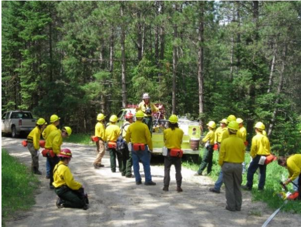
Students at the 2018 Fire Academy receive instruction on the use, deployment, and tactics of engines on wildland fires

The 2018 Wildfire Academy was held June 4-8, 2018, at Itasca Community College in Grand Rapids. The Academy offered 33 classes to 850 students. Participants included staff from Minnesota DNR; Wisconsin DNR; Michigan DNR; Iowa DNR; National Park Service-Wisconsin; USFS – Minnesota (both national forests), Wisconsin, Michigan, New York, Missouri; U.S. Fish & Wildlife – South Dakota and Nebraska; and the Bureau of Indian Affairs. Students also came from the Conservation Corps of Minnesota and Iowa, Nature Conservancy, Minnesota Department of Transportation, and numerous Minnesota fire departments.