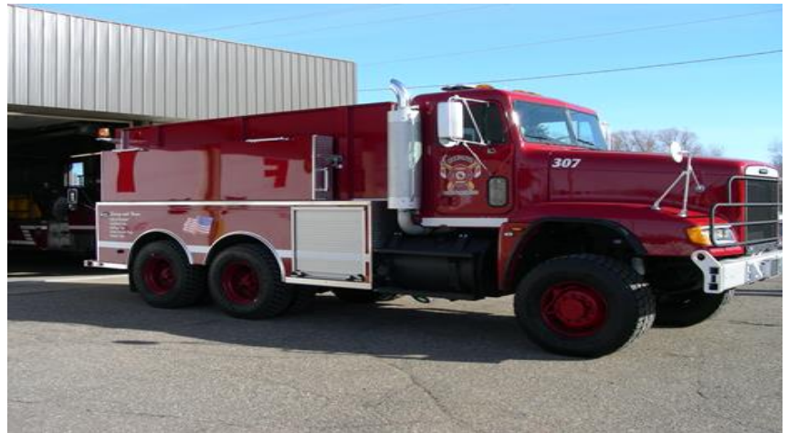
Federal Surplus Property Converted for Use by Randal Fire Department

In FY2018, the Firefighter Federal Property program (FFP) obtained $12.5 million in equipment and supplies, which it distributed to 410 Minnesota communities and four state agencies. Highlighted items include medical supplies and equipment such as tourniquets, bandages, defibrillators, and portable generators. Rolling stock included items such as a Chevy Tahoe, Freightliner chassis, and ATVs.