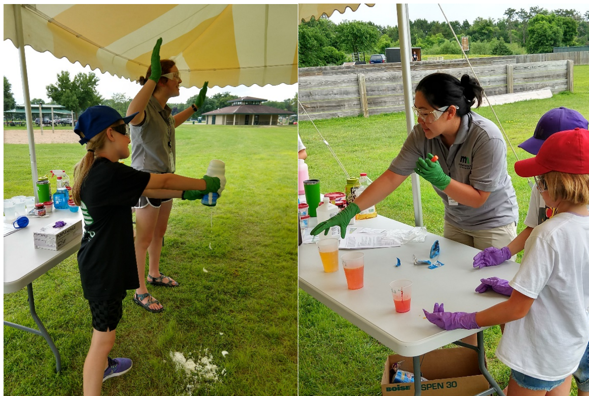
MDH staff teach chemical safety basics through interactive demonstrations.

City-organized Safety Camps are eager for experts to teach chemical safety and the TFK program has led sessions on this topic for the past seven years at Cottage Grove's Safety Camp. Children learn how to identify safe and unsafe chemical products. In 2019, MDH added a new chemical safety topic: identifying sustainable products for the home. Children participated in making do-it-yourself, low-cost, and toxic-chemical free cleaning products they were able to bring home.