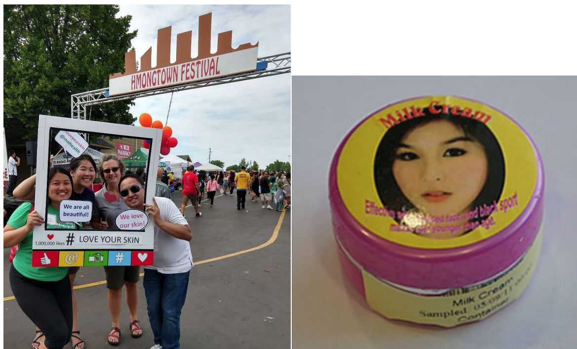
MDH staff and community volunteers at the HmongTown Festival engage in conversation and share educational materials about mercury in skin lightening products.

SPOTLIGHT STORY: In June 2018, TFK program staff participated in the HmongTown Festival to share information about mercury in skin lightening products. More than 15,000 people attended the Festival over two days. A member of the community attending the Festival talked with the TFK program staff and viewed the available educational materials. That community member realized the skincare product she used at home was pictured (right) in the educational handout the TFK program provided her. After a longer discussion between TFK program staff and the community member, she understood that the skin lightening product was harmful to her health as well as the health of her multigenerational family home and that she needed to dispose of the product through a local household hazardous waste disposal site.