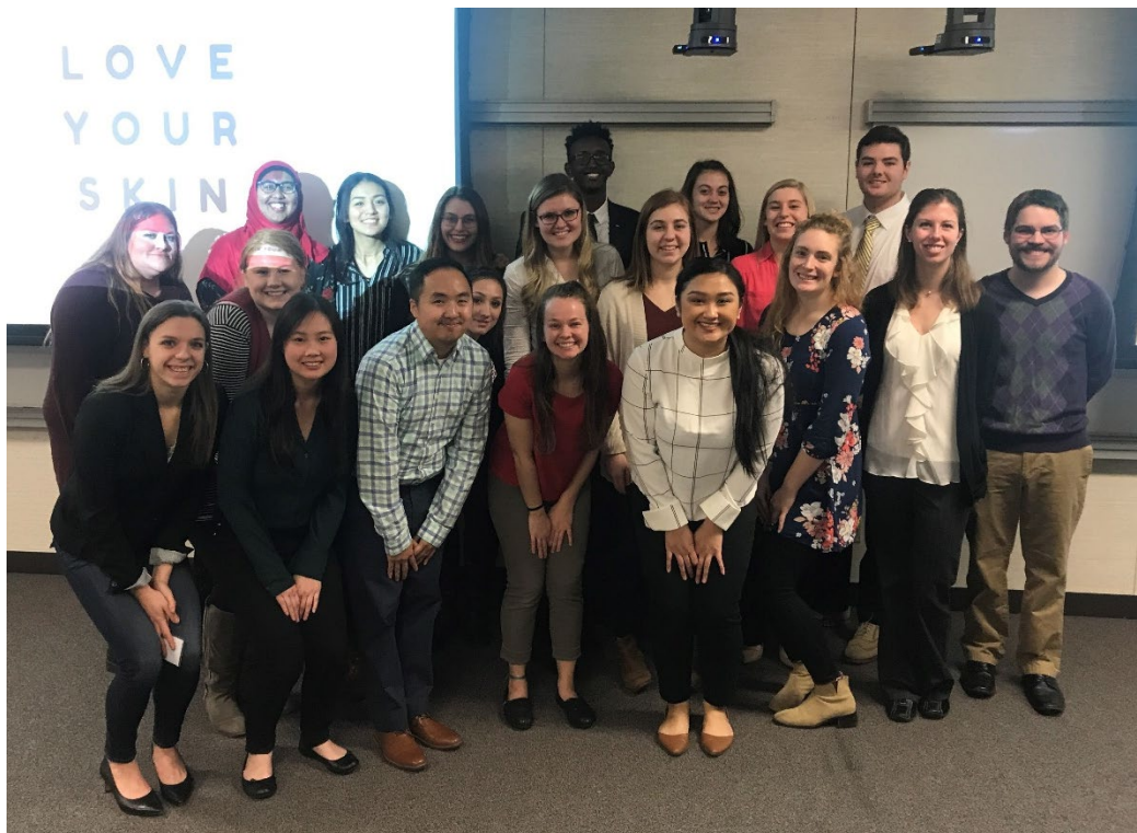
Students from Hamline University present their findings and outreach plans for the Hmong community on December 11, 2017 to the Mercury in Skin Lightening Products Workgroup, an interagency and community workgroup, as well as additional guests from the community, state agencies, and universities.

In 2019, members from the TFK program and CPIT worked with the University of Minnesota’s undergraduate Green Chemistry course to present two lectures and class discussions about Minnesota’s laws and government-related efforts to protect human and environmental health from toxic chemicals in consumer products. After the lecture, students were asked to evaluate how beneficial the lectures were to help determine if CPIT will continue to speak to the Green Chemistry course in future years: