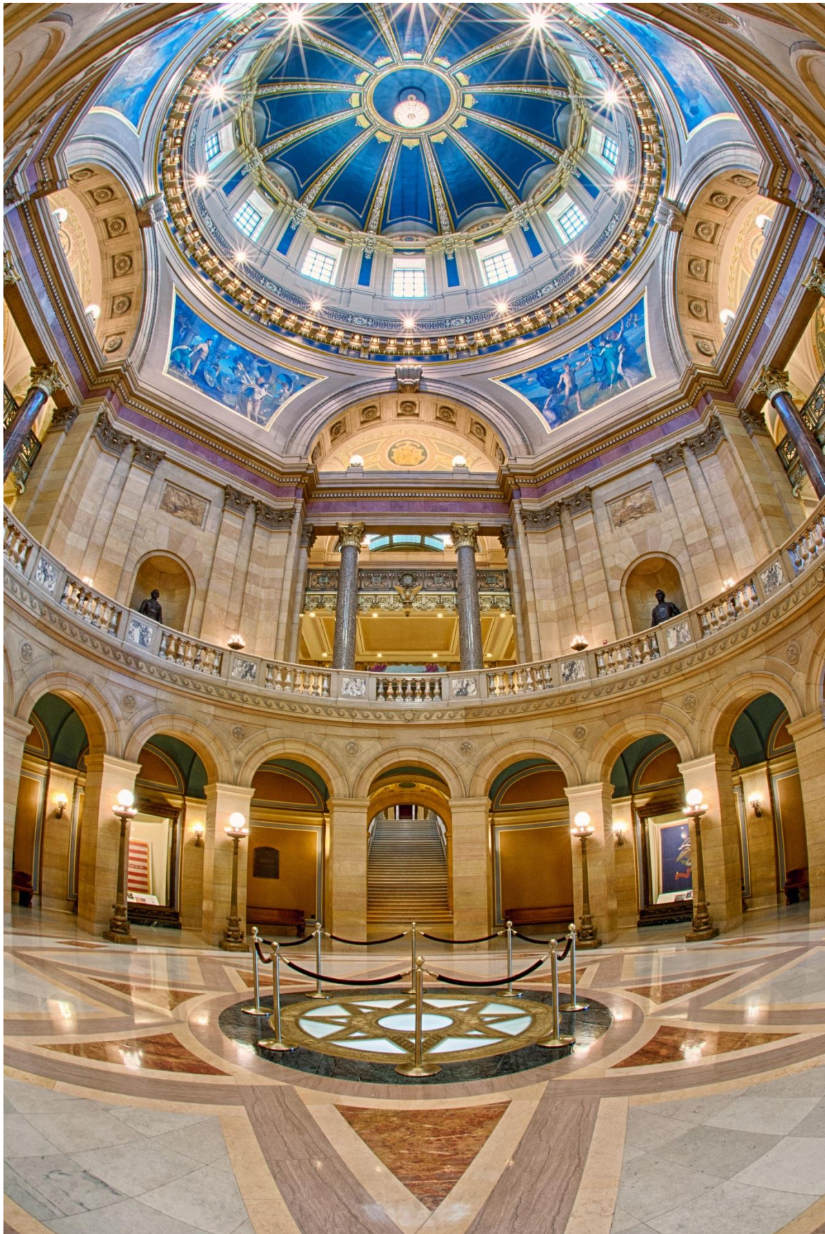
Image: Capitol Rotunda