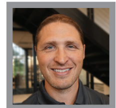
TRANSPORTATION Chris Hadfield minntran.org