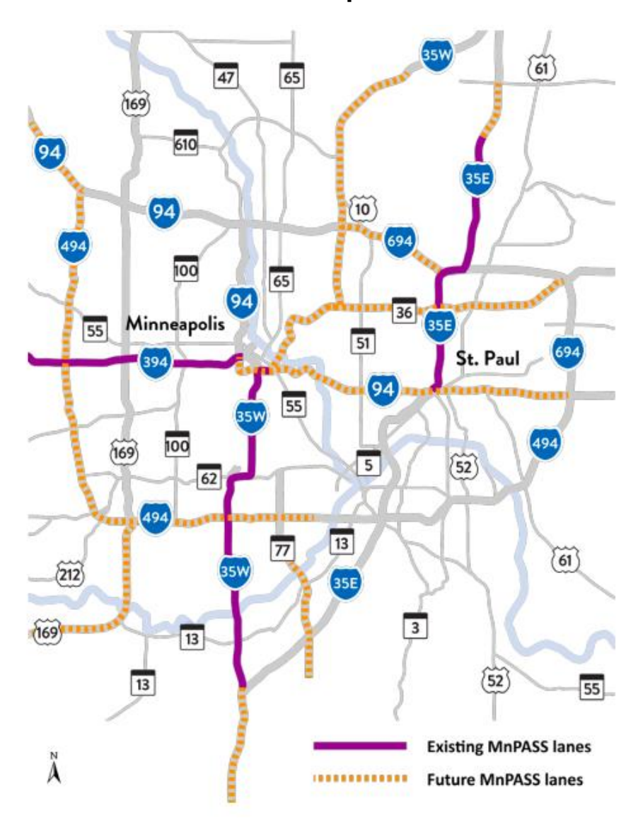
Exhibit 1: MnPASS Corridor Map