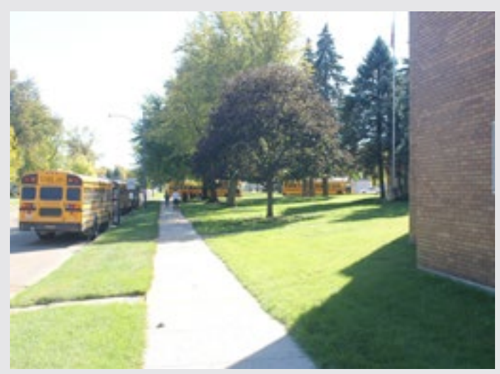
Buses wait for students outside Fulda Elementary School.

The plan lays out various actions that units of government and other stakeholders can take to reduce potential risk with a given hazard. These include actions such as ensuring access to backup generator power for severe storms, educating residents on disaster preparedness, developing quarantine plans for public health emergencies, and others.