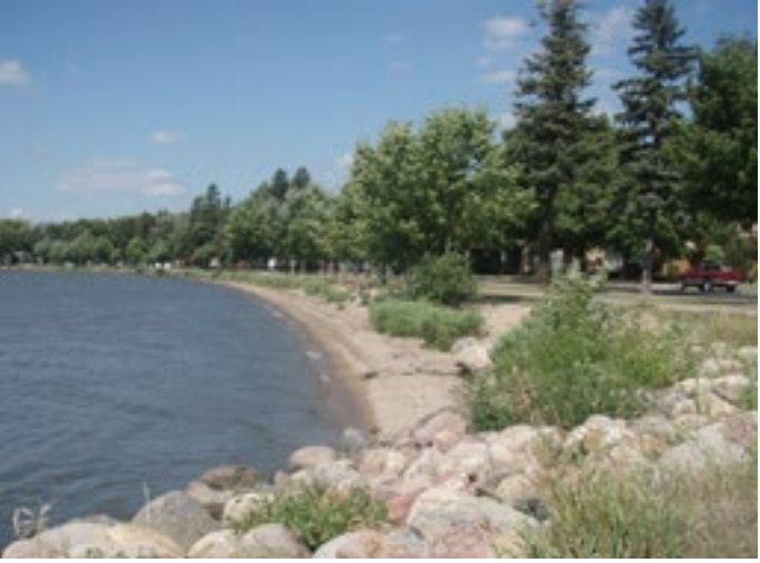
Shoreline of Okabena Lake, Worthington.

The complete report is available at: www.swrdc.org or www.regionfive.org