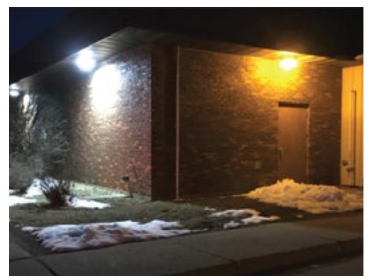
Old lighting (right) versus white LED lighting (left) of Federated Rural Electric's Jackson office. Federated Rural Electric offers LED lighting rebates to help offset installation costs to improve lighting and decrease electric bills.

Project will provide an In-home Education Course and Energy Savings Application for oneon-one education to a minimum of 20 homes. The