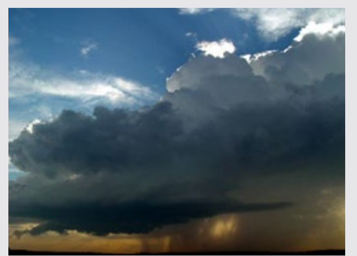
Hazard Mitigation Plans can reduce potential risk when faced with natural hazards such as severe thunderstorms, heavy rain and flooding.