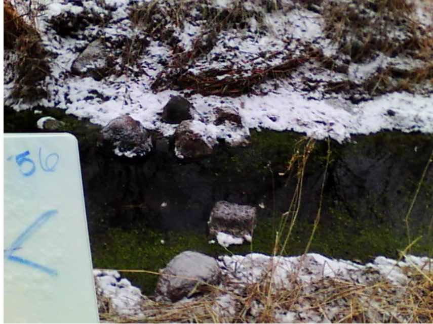
Figure 1. Photograph along Cold Spring Creek taken in January 2018.