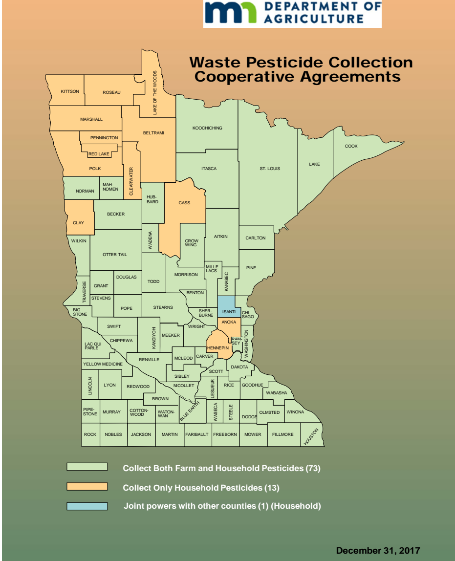
Figure 1. A state map showing cooperative agreements. DEPARTMENT OF AGRICULTURE Waste Pesticide Collection