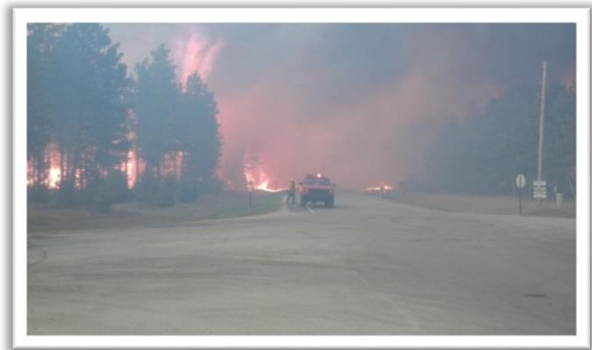
2014 Karlstad Wildfire

Other projects involved Senior Disaster Preparation presentations, Emergency Operations Plan Template creation, participating with Minnesota National Guard in a mass sheltering exercise, meeting with Manitoba emergency management personnel to partner on future initiatives and disaster response, updates to Threat and Hazard Identification and Risk Assessment Plan (THIRA), pet sheltering, creation of a regional resource manual, credentialing, and regional response exercises.