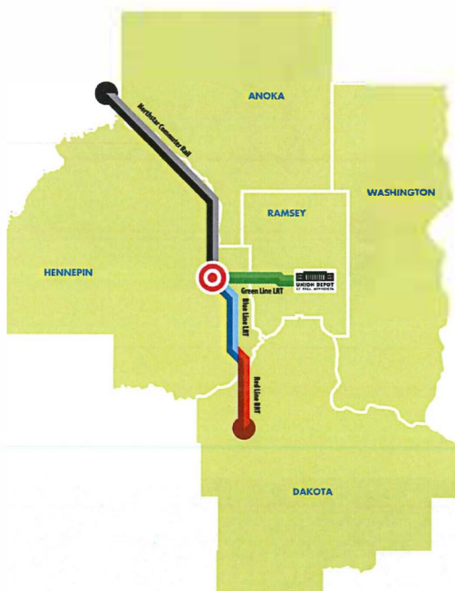
CURRENTLY OPERATING LINES

Existing Lines: 4 Miles: 79 Stations: 47