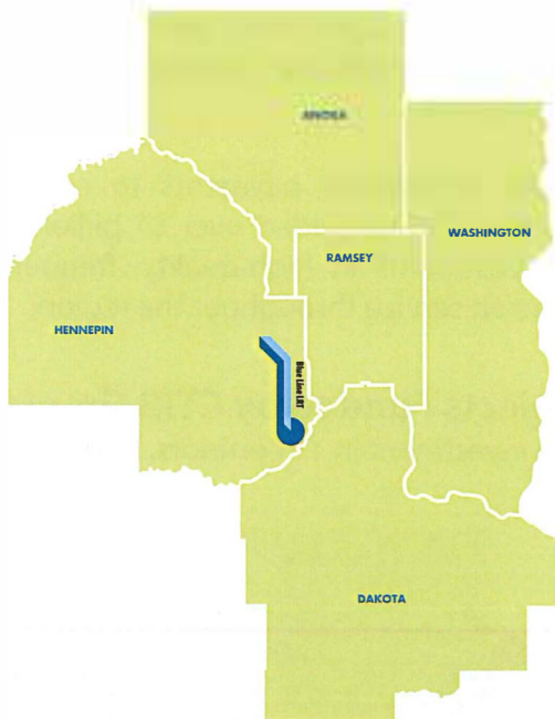
TRANSITWAYS OPERATING BEFORE CTIB

Existing Lines: 1 Miles: 12 Stations: 19