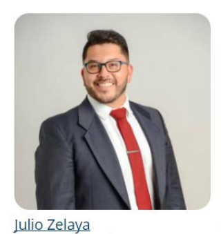
Appointed: June 2017/Expires: January 2021