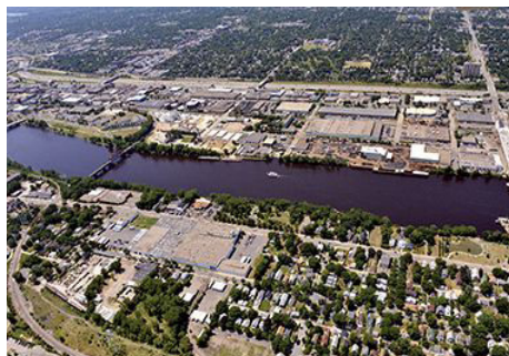
Above the Falls Regional Park Minneapolis Park and Recreation Board [Source]