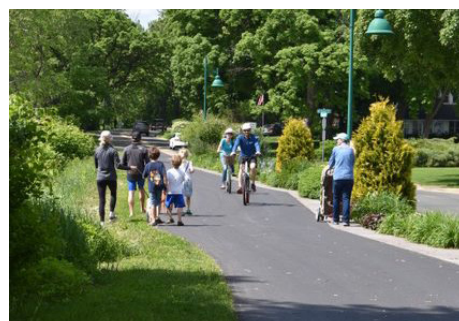
Lake Links Regional Trail Ramsey County