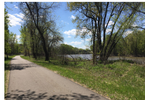
Minnesota River Greenway Regional Trail Dakota County