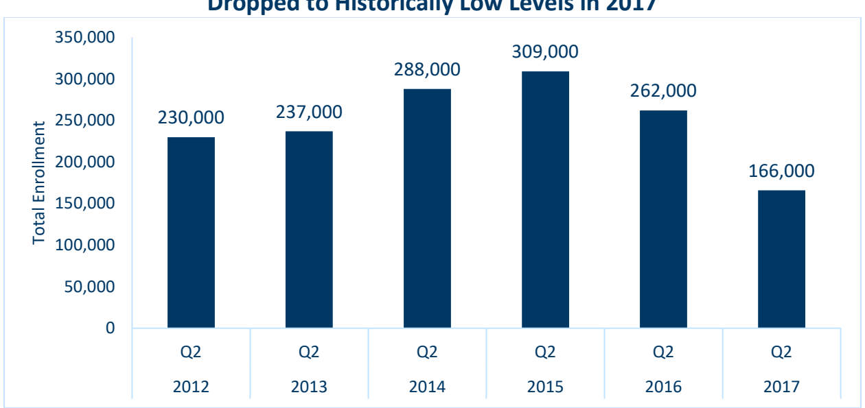
Figure 1: Enrollment Peaked in 2015 and Dropped to Historically Low Levels in 2017

Enrollment in Minnesota's individual market began rising with implementation of key provisions of the ACA that included a requirement that individuals hold insurance, the availability of premium subsidies to eligible enrollees, the establishment of minimum benefit requirements, and the creation of insurance exchanges to facilitate comparison shopping for consumers, among other things. The number of people with individual market coverage in Minnesota peaked in 2015, then declined in 2016 and in 2017 (Figure 1).