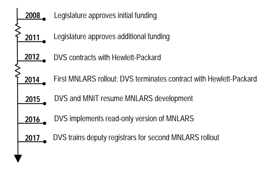
Exhibit 1: MNLARS Timeline