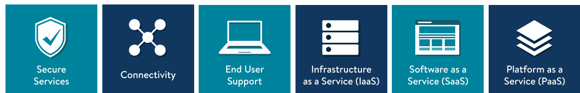
Services provided by Minnesota IT Services

Minnesota IT Services has implemented a transformative delivery model that shifts the agency from a service provider model to a true partnership with each State of Minnesota agency. We will use our Governance Framework to ensure that feedback from agency leaders is incorporated into the services that we provide and that the cost of the service is transparent. Our partners will help us determine if a service should be delivered centrally for the enterprise, locally due to highly customized business needs, or through a third party. We will make smart IT investments that deliver quality services at a good value for the state.