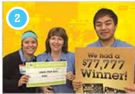
Kwik Trip #357 in Rochester $500 bonus