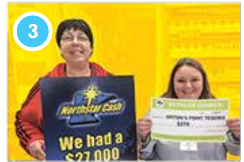
Orton's Point Tesoro in East Grand Forks $270 bonus