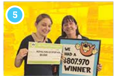
Royalton EZ Stop #38 in Royalton $5,000 bonus

Retailers earned an average of $11,719 per business in FY16