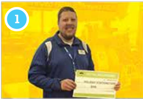
Holiday Stationstores Inc. in Duluth $500 bonus