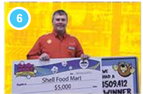
Shell Food Mart in Blue Earth $5,000 bonus

Retailers earned an average of $11,719 per business in FY16