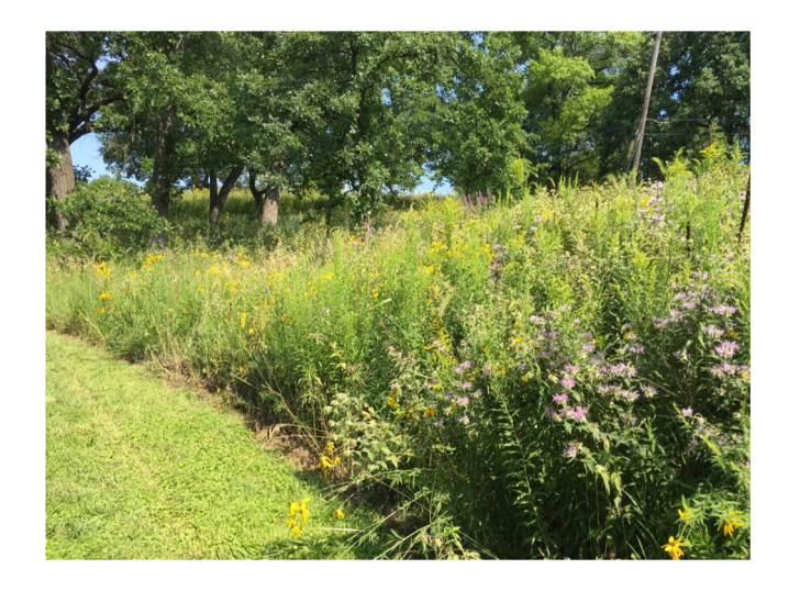
Side-by-side restored and non-restored savanna woodland

Activities in prairie and woodland: Prairie mowing and prescribed burn; woodland invasive buckthorn cutting, removal and stem treatments