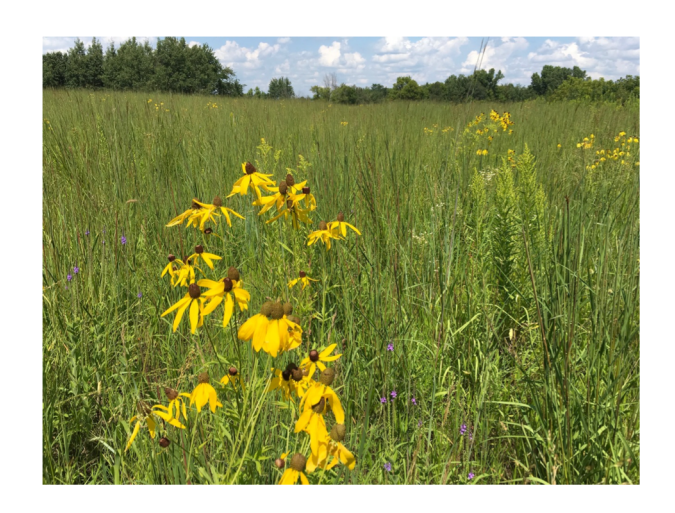
Healthy prairie after burn

Activities: establishment mowing, herbaceous weed control, site preparations, seeding, removal of woody plants, prescribed burn