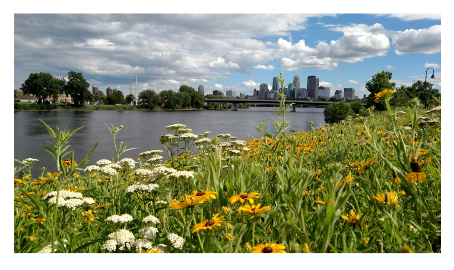
Restored prairie in the heart of Minneapolis