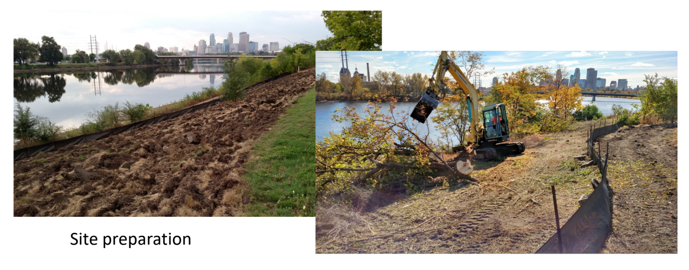
Removing non-native woody plants