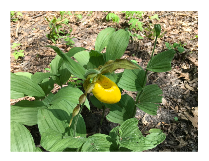
Yellow Lady's-slipper in restored forest understory