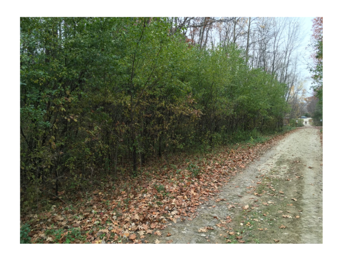
Dense buckthorn hedge before removal