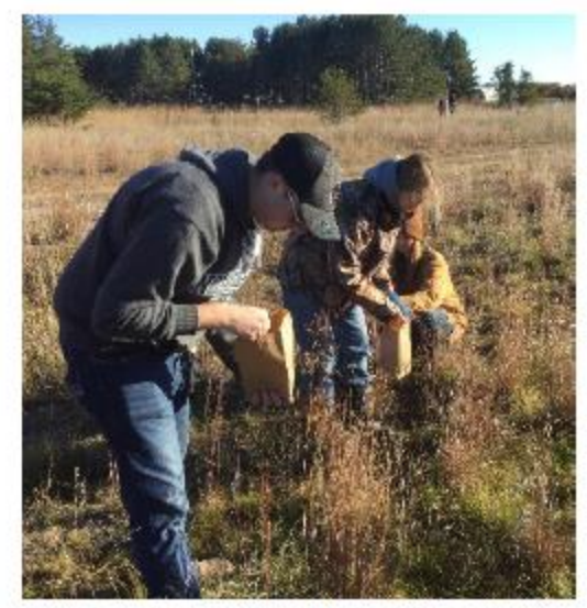
CLC NR Students collect native seed