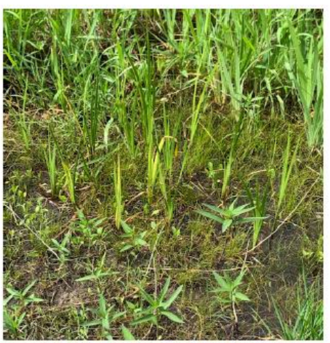
June 10, 2020. Type 3 wetland plot 1 regrowth. Marsh Milkweed, Sweet Flag, and Blue flag Iris.