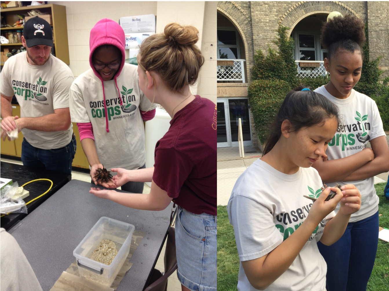
Graduate students led behind-the-scenes lab tours on the St Paul campus and shared their education experiences.