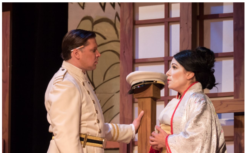
■ NORTHERN LIGHTS MUSIC FESTIVAL, MADAMA BUTTERFLY