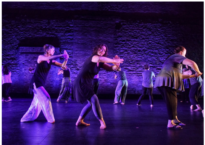
■ GILDA'S CLUB

The Minnesota State Arts Board, acting on behalf of Minnesota voters and elected officials, relishes its role distributing state-allocated funds through arts and heritage