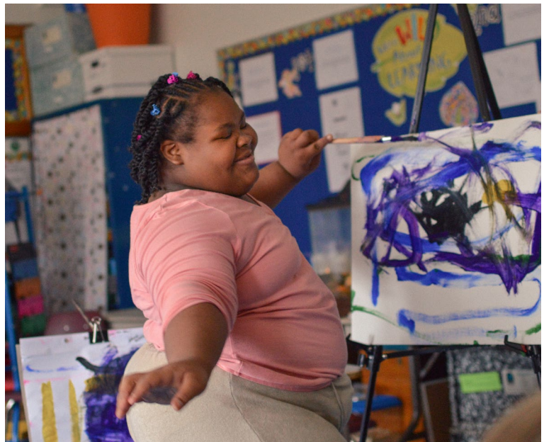
■ UPSTREAM ARTS