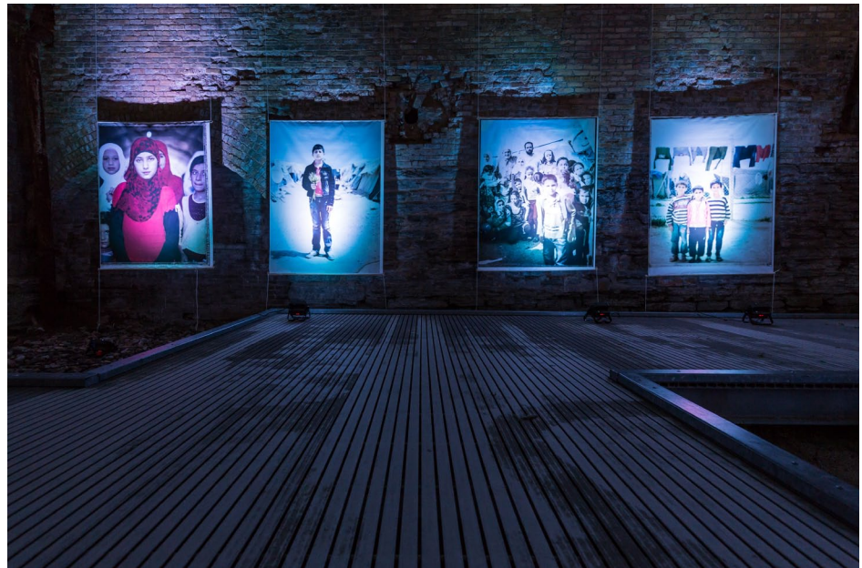
■ MIZNA, STILL LIFE SYRIA

The Minnesota State Arts Board expands its capacity and extends its reach by working in collaboration with other agencies and organizations that share similar goals and philosophies. The following are key partnerships that were in place during fiscal year 2016: