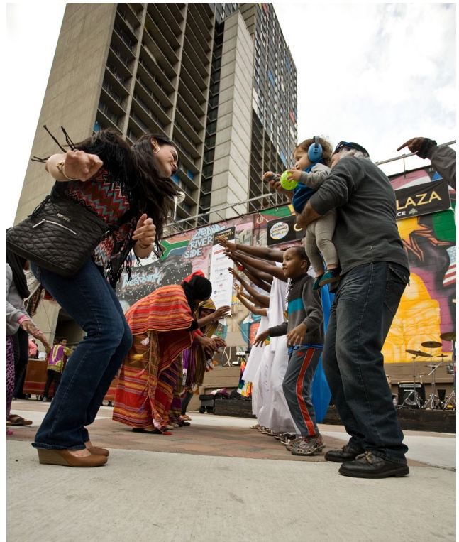
■ THE CEDAR, COMMUNITY PLAZA

The Minnesota State Arts Board is led by a statewide citizen board appointed by the Governor and approved by the Senate. The Arts Board is oriented and focused on outcomes, and has consistently approached its responsibility for sound stewardship and conscientious fiscal management of public funds with a sharp goal of producing results for Minnesotans across the state. The Arts Board investment plan for the arts and cultural heritage fund includes grant programs and services designed to make the arts more available, to foster activities designed to engage Minnesotans who have historically lacked access to the arts, and to help sustain the rich landscape of existing Minnesota artists and arts organizations.