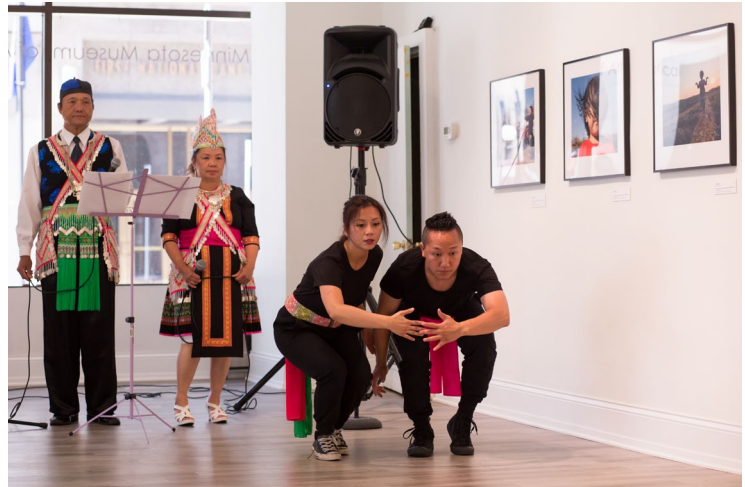
■ HMONG MUSEUM