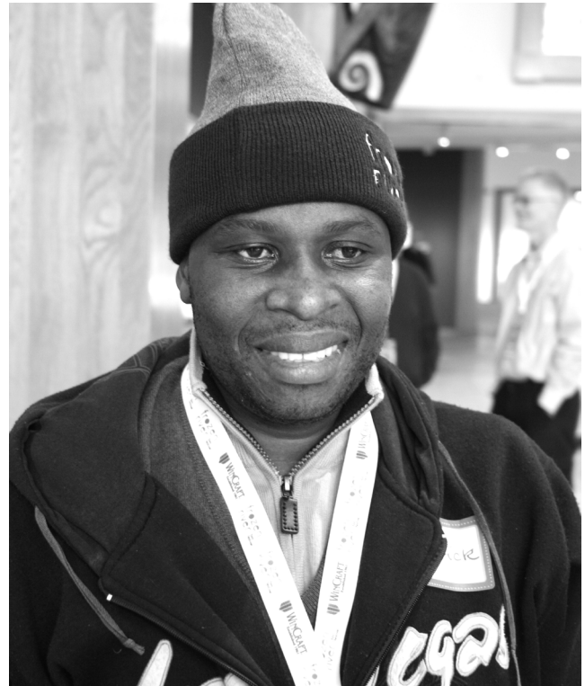
■ FROZEN RIVER FILM FESTIVAL

The following are examples of how fiscal year 2016 funds were invested in arts and cultural heritage: