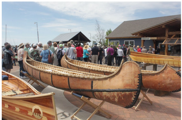
■ NORTH HOUSE FOLK SCHOOL

GOAL STRATEGY The arts thrive in Minnesota Foster visionary, skilled arts leaders and organizations statewide Ensure sufficient resources to sustain the arts and artists Serve as a clearinghouse of information on best practices and successful programs