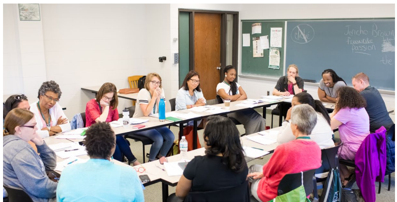
■ MINNESOTA NORTHWOODS WRITERS CONFERENCE