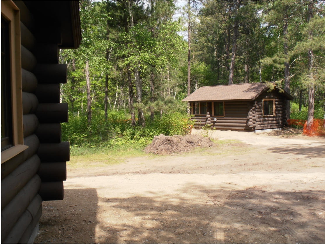
Camper Cabins – Lake Bemidji State Park