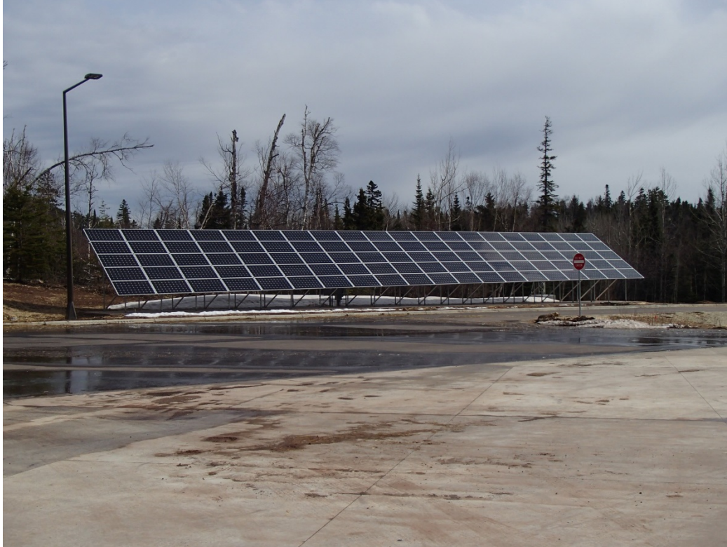
Photovoltaic Solar Panels - Tettegouche State Park