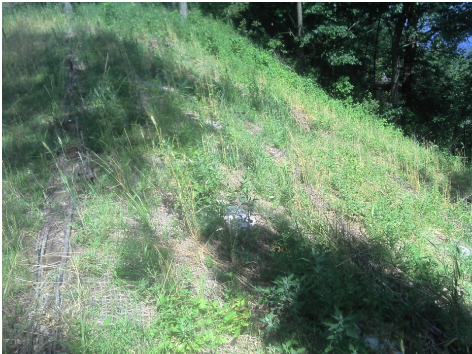
Repairing and stabilizing bank erosion – St. Croix State Park