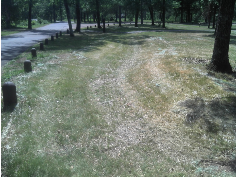
Bioswale – St. Croix State Park