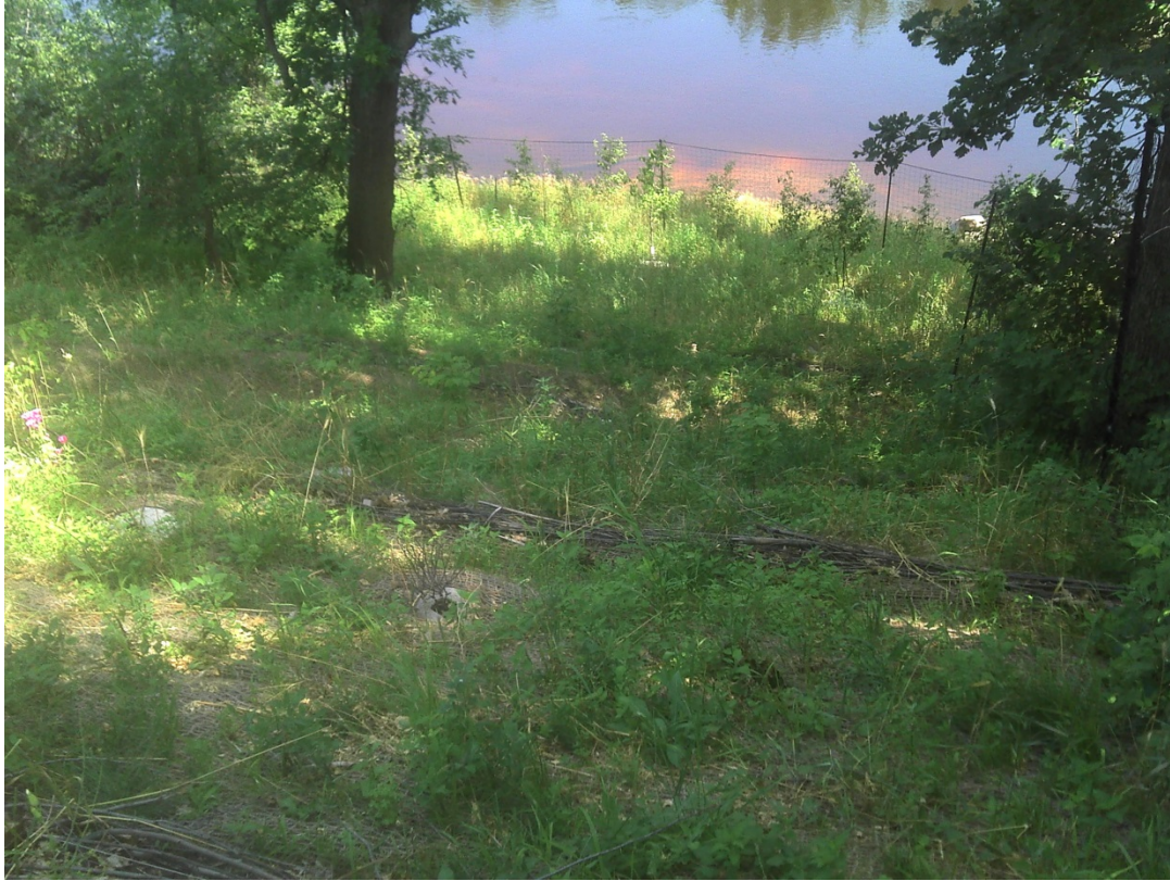
Repairing and stabilizing bank erosion – St. Croix State Park