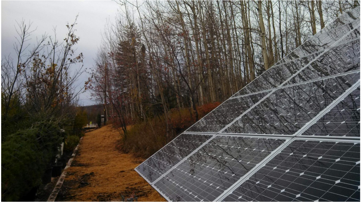
Solar Panels – Tettegouche State Park