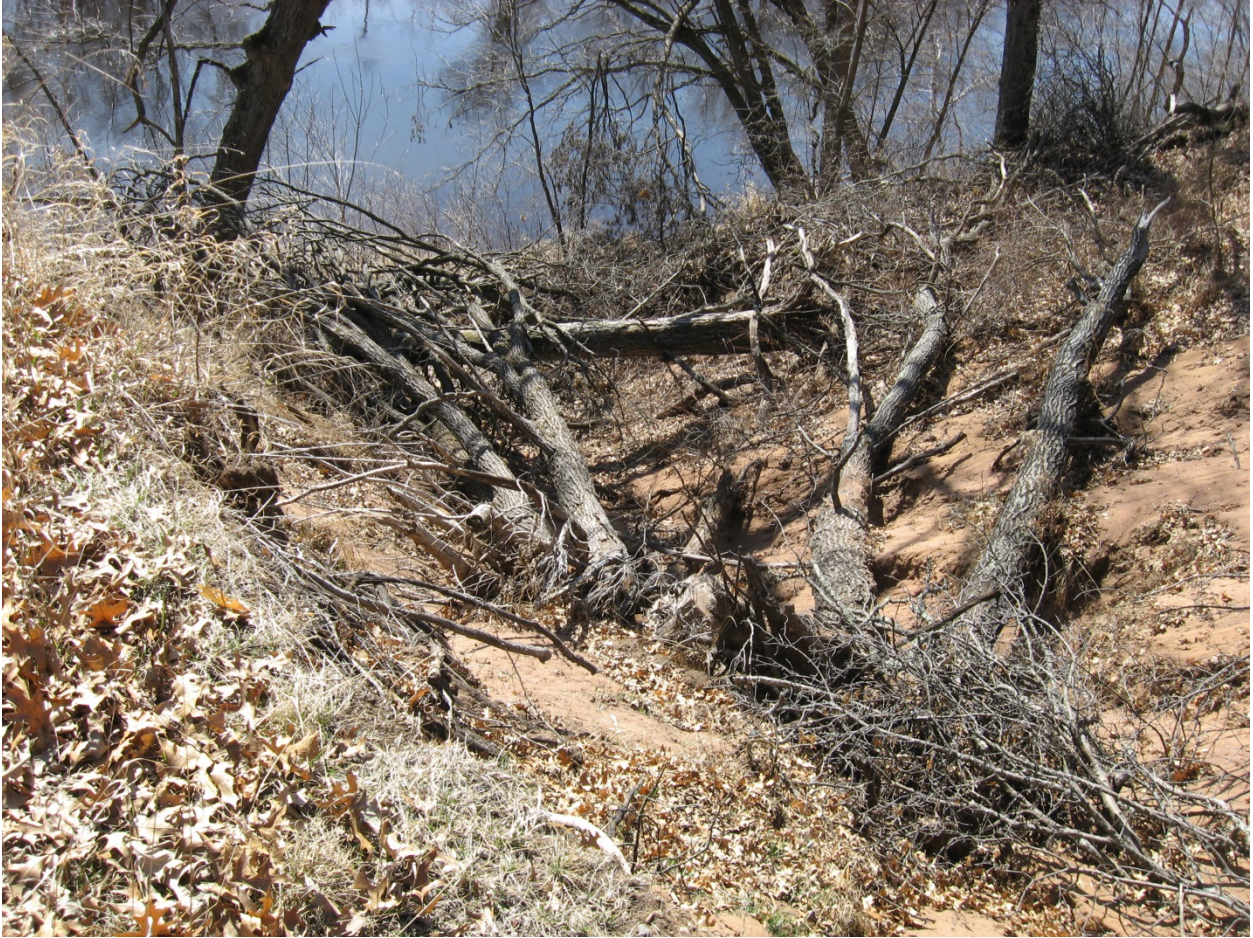
Prior Eroded Condition – St. Croix State Park