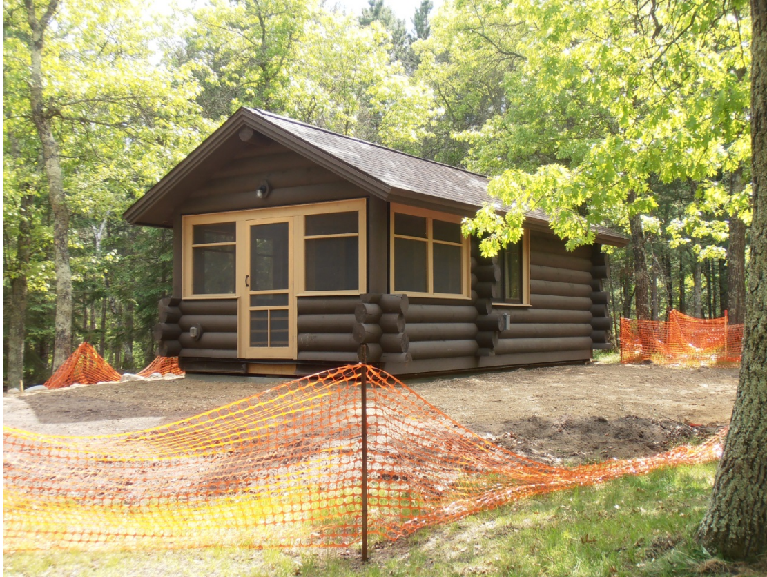
Camper Cabins – Lake Bemidji State Park