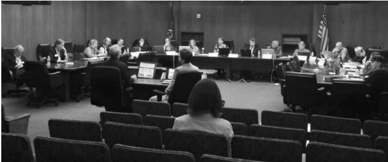
Historic Resources Advisory meeting (HRAC), Nov. 5-6, 2015

The ACHF-funded Minnesota Historical and Cultural Heritage Grants Program provides a valuable opportunity for non-profit and educational organizations, government units, and tribal organizations across Minnesota to preserve and share the state's history and cultural heritage.