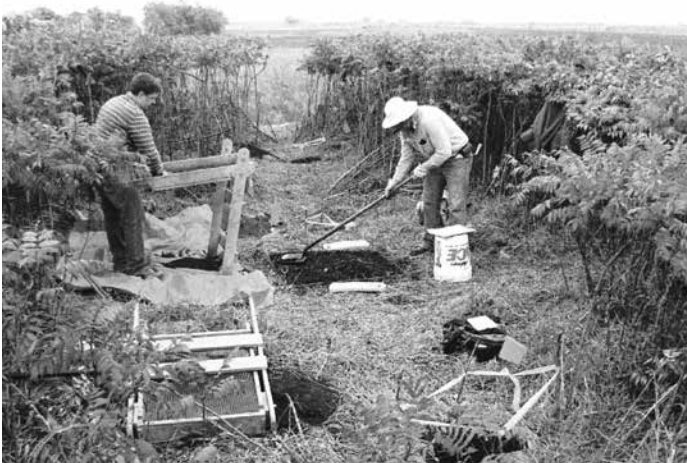
Excavation in Lac qui Parle County.

This project involves intensive field survey in Lac qui Parle County, with the objective of increasing our knowledge of the precontact archaeology of the county. It will include formal excavation at a known archaeological site that potentially represents a very early human occupation in the Minnesota River Valley. This site was initially investigated as part of the Minnesota River Trench project listed below.