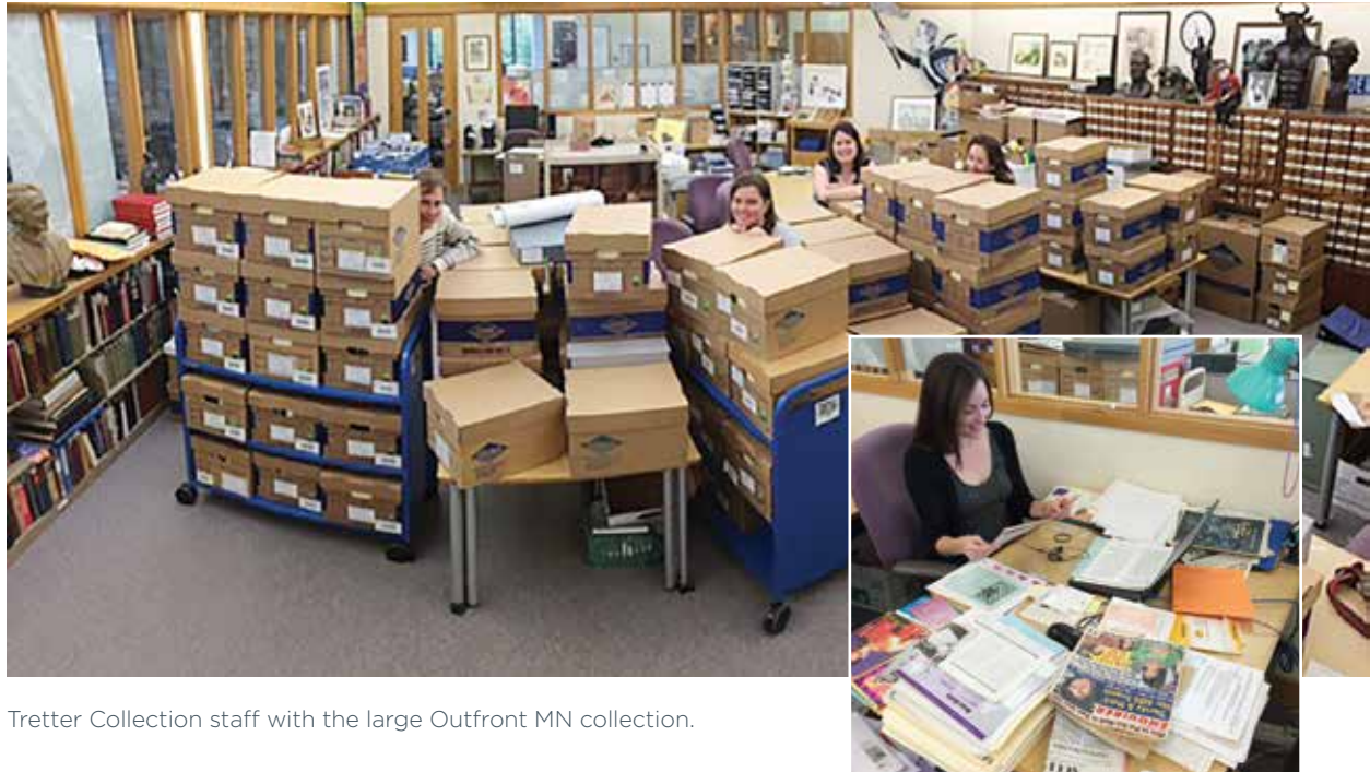
Tretter Collection staff with the large Outfront MN collection.

Regents of the University of Minnesota (U of M Libraries) Minneapolis, Hennepin County