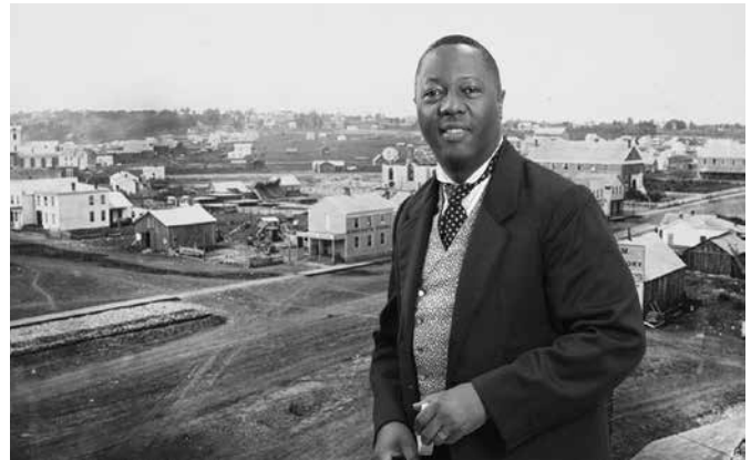
The History Live! lesson on the Emancipation Proclamation was produced in partnership with the Jewish Community Relations Council.

For the first quarter of FY16, the History Live! program updated its business plan with a goal to increase overall revenue and serve more students. It provided 14 programs serving 421 students through Oct. 31, 2015.