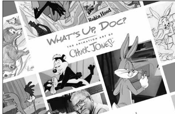
What's Up Doc? The Animation of Chuck Jones travelling exhibit.

Indian Americans in Minnesota and their contributions, culture, and accomplishments. The Minnesota section will be co-created by representatives of the state's Indian American community, who will advise MNHS on a community-based marketing strategy. Specific communication to the local Indian audience will be enhanced with marketing to the general public through media relations and social media, as well advertising in print, digital, broadcast, and outdoor mediums.