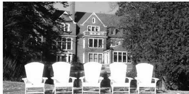
Minnesota Alliance of Local History Museums (MALHM) 2015 state conference was held at Duluth's Glensheen Historic Estate.