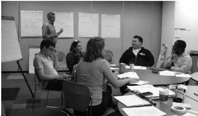
MNHS staff working on continual improvements to lifelong learning activities.

Fifty-eight new skilled volunteer positions were added, contributing 4,700 volunteer hours.