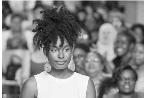
In connection with the Inspiring Beauty: 50 Years of Ebony Fashion Fair exhibition, MNHS hosted Sister Spokesman: Loving Your Hair , a community program that included a hair fashion show, presentations on styling natural African-American hair, and an array of vendor and organization booths.

The exhibit run was extended through Jan. 3, 2016, due to high demand. Initiating a new collaborative model, MNHS produced a marketing campaign designed in cooperation with members of the local Hmong community, which resulted in strong attendance by first-time visitors to the Minnesota History Center in FY15. More than 3,500 people attended on the exhibit’s opening day, March 7, 2015, 75 percent of whom self-identified as Asian/Pacific American. The exhibit garnered impressive media coverage locally and nationally.