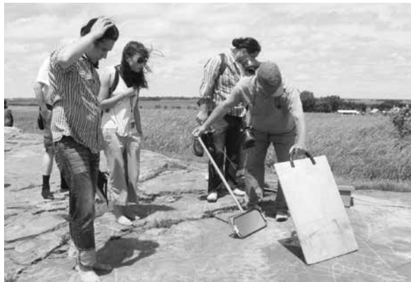
American Indian undergraduate student fellows learned about the museum and archaeology fields.

American Indian undergraduate students from across Minnesota participated in this unique summer educational experience. The students selected for this intensive 17-day residential program attended onsite presentations throughout Minnesota and experienced hands-on learning about the museum and archaeology fields and other historical and cultural preservation organizations. The students also learned about various career paths and academic requirements for working in these types of organizations, both on and off reservations, as well as particular challenges faced by American Indian communities related to preserving tribal heritage.