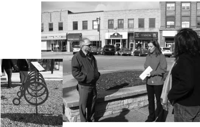
MNHS's Heritage Preservation department works with multiple statewide partners on Minnesota Main Street, which works to revitalize historic downtown business districts.

MNHS continued its previous collaboration with Macalester College and the Somali community to add an additional 10 interviews to those that have already been completed. The new interviews focused on women's experiences.