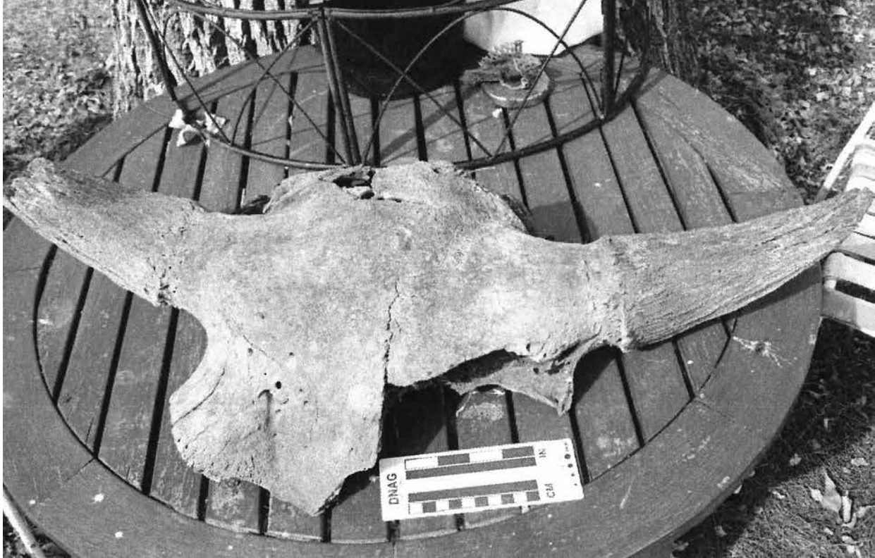
Cranial vault (skull) of bison recovered from Spring Creek in Chippewa County, part of the Prehistoric Archaeology of the Minnesota River Trench project. (See p. 52)

Current and accurate data on historic and archaeological sites is crucial to understanding our past and to preserving Minnesota's history for future generations. As of late 2015, the Oversight Board of the Statewide Survey of Historical and Archaeological Sites (comprising representatives from the Minnesota Historical Society, Office of the State Archaeologist, and Minnesota Indian Affairs Council) has overseen contracting for two new projects, and continues to oversee two projects started in FY15: (continued on next page)