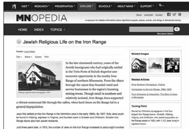
One of the new essays added to the MNopedia library in 2015.

MNOpedia is an award-winning online encyclopedia of Minnesota created by MNHS, designed for use by a general audience, teachers, and students. In 2015, the MNOpedia library grew to include essays on Hmong, African American, and Jewish history, and articles on topics as diverse as Minnesota in World War I, immigration to the Iron Range, Dayton’s department store, and the Grange in Minnesota. A new feature, This Day in Minnesota History, a Minnesota book of days, was added. The online newspaper MinnPost published MNOpedia articles weekly.