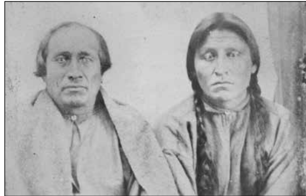
Shakopee and Medicine Bottle at Fort Snelling (1864).

American Indian ceremonies were held at Historic Fort Snelling in November 2015, marking the 150th anniversary of the execution of Sakpedan (Shakopee) and Wakanozhanzhan (Medicine Bottle) at Fort Snelling. They were convicted by a military commission for their participation in the U.S.-Dakota War of 1862. MNHS provided a community meal for the Dakota community immediately following the ceremonies.