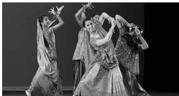
Beyond Bollywood travelling exhibit.

This traveling exhibit from the Smithsonian Institution chronicles the history and experiences of Indian Americans in the United States. A Minnesota-themed extension will augment the exhibit, which opens April 30, 2016, containing artifacts that illustrate stories of