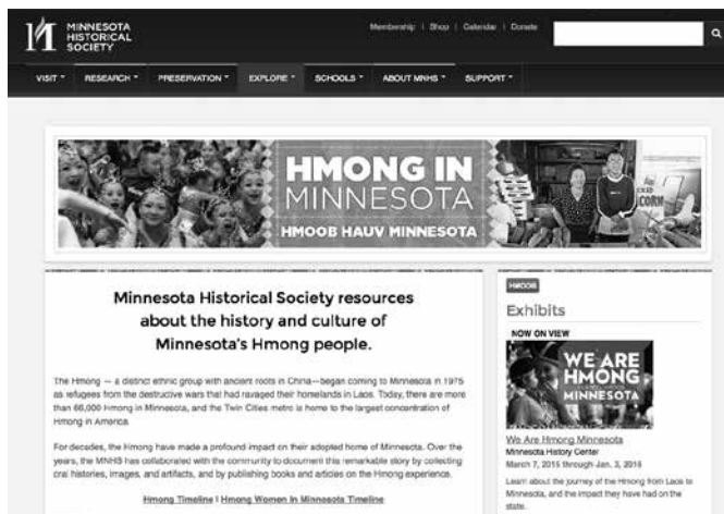
New website aggregates MNHS resources on Hmong Americans in Minnesota.