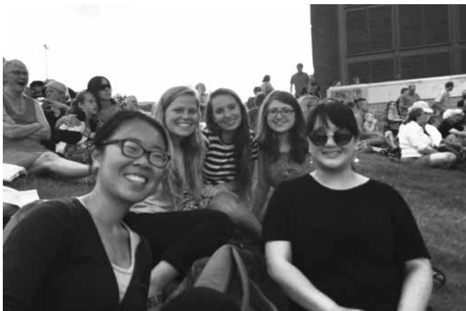
MNHS interns were among the more than 1,100 who attended the performance of Kong/Shu Project, a Hmong pop band, at the 9 Nights of Music program, Minnesota History Center, August 4, 2015.

College student interns representing Minnesota’s diverse communities are placed across MNHS in various departments and sites. During their semester-long internships, students have the opportunity to work alongside museum and public history professionals to enhance their skills and apply their knowledge in a professional environment. The activities focus on