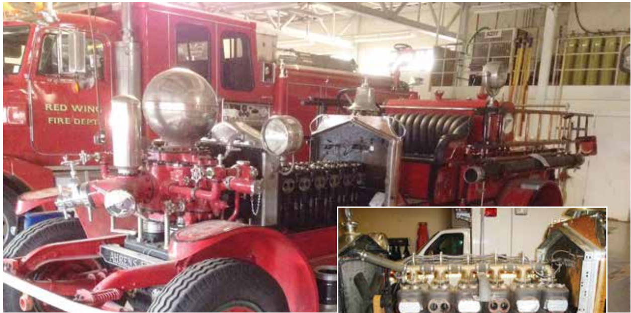
Red Wing's restored 1925 fire apparatus brings a sense of pride to the community.

Red Wing Fire Department Red Wing, Goodhue County