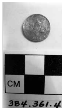
Clark & Frost toothbrush handle and 1852 coin found at Fort Snelling during archaeology excavations.

Collaborative, student interns spent the 2015 fall semester assisting project staff with inventory and research. Artifact data was shared with University faculty for use in their courses. To date, over 98,000 catalog records have been created, describing more than 180,000 artifacts recovered during archaeological excavations at Historic Fort Snelling. Over 300 objects have had descriptions and images added to MNHS's Collections Online website, where information about them is available to the general public. Project staff are creating a pilot website for sharing artifact data and linking it to similar collections around the country. It is expected that the remaining Fort Snelling artifacts will be inventoried by the end of FY16.