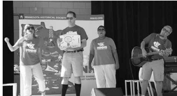
Performance of History-on-a-Shtick, Minnesota State Fair, August 27, 2015.

MNHS and the Minnesota State Fair Foundation are increasing awareness and knowledge of Minnesota history by providing quality programming for visitors to the Great Minnesota Get-Together. In 2015, the partners added new visual and written content for the Minnesota State Fair History Walking Tour brochure. Audio and visual content was available with the smartphone tour component, and staff presented audio/visual content via social media throughout the fair. Some 40,000 brochures were distributed throughout the fairgrounds during the run of the fair.