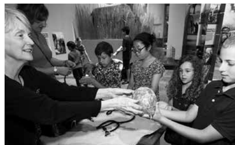
Students interact with artifacts as part of their Play the Past technology-enhanced field trip to Minnesota History Center.

Based on the overall success of the program, Play the Past was recently awarded a grant in March 2015 for $199,936 from the National Endowment for the Humanities to expand the program from the Then Now Wow exhibit to also include the Minnesota’s Greatest Generation exhibit.