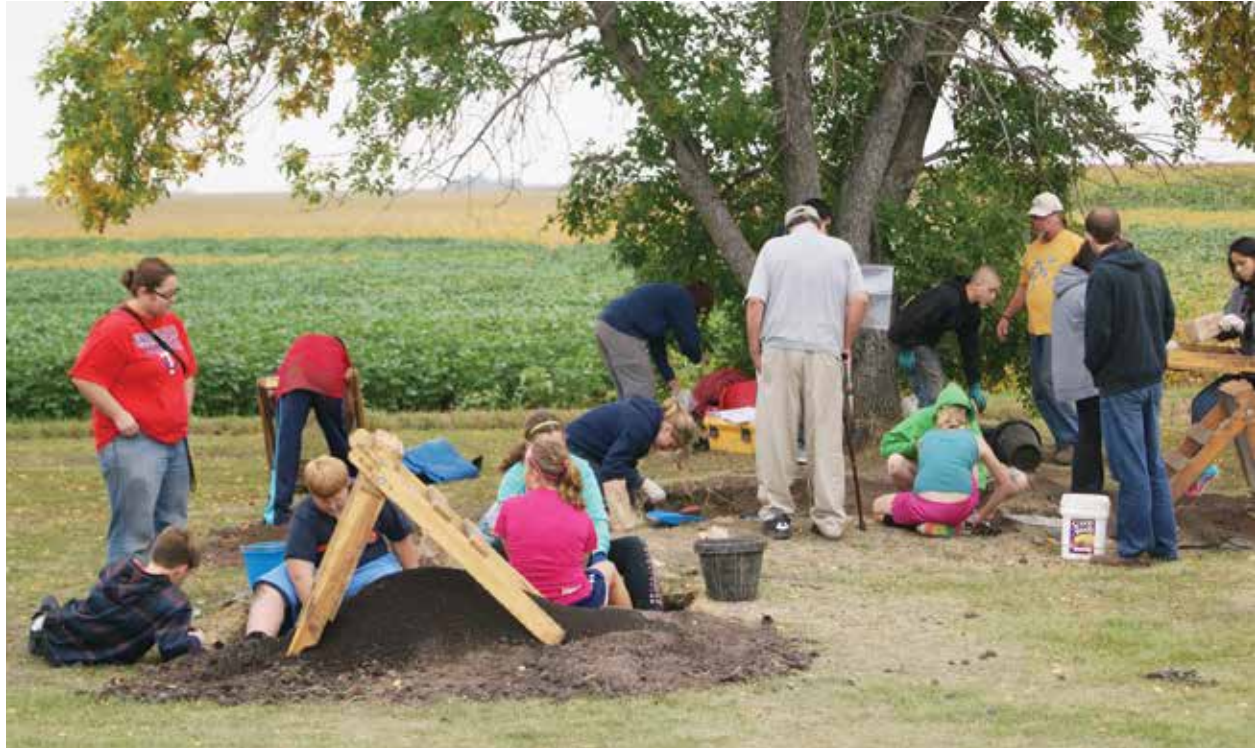
The archaeology dig at District #44 School in Tintah, Traverse County, inspired youth to become engaged in their community's history.

Archaeologists worked with local school children to excavate historic items from the National Register of Historic Places-listed District #44 school dumping site. The project's purpose was to engage elementary students in a hands-on learning experience through formal archaeological excavation. This was achieved by teaching the importance of archaeology and history through excavation; revealing the hidden history and stories of the District #44 School; preserving artifacts from the school's past for future generations; and inspiring youth to become engaged in their community's heritage.