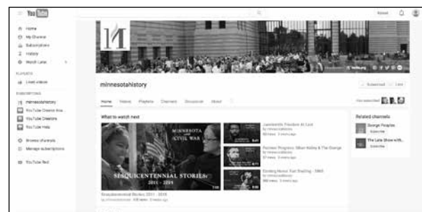
MNHS YouTube channel shares multimedia content with the public.

Legacy funds support 2.5 full-time multimedia positions, along with materials and services to produce video, audio, and other multimedia content for education, interpretive, and exhibit programs across MNHS. The content is also used to inform the public about these MNHS programs.