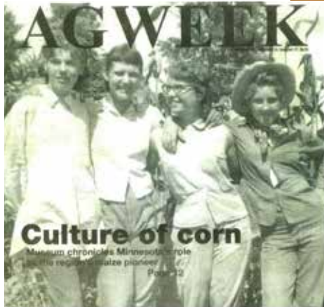
Permanent exhibit celebrates history of seed corn industry in Dassel, Minnesota. The subject made the cover of Ag Week , Aug. 17, 2015.