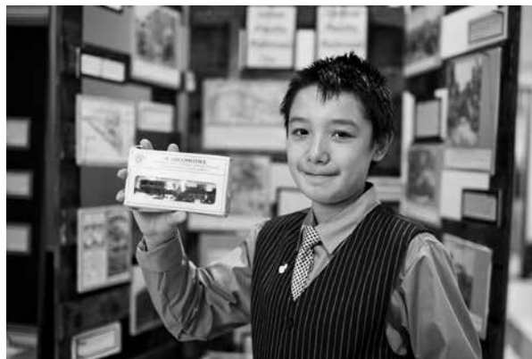
MNHS and Minnesota colleges and universities have created a national model for “campus to classroom” mentorships for National History Day in Minnesota students.

Through this program, partners are extending the reach of National History Day in Minnesota. MNHS professional staff members coordinate school services with an emphasis on support for students from diverse backgrounds. Higher education partnerships help build college readiness skills for middle and high school students and strengthen the mentoring skills of Minnesota college students. Undergraduate students from the U of M and MNSCU colleges are trained to become History Day mentors and work with History Day students at inner city and rural schools.