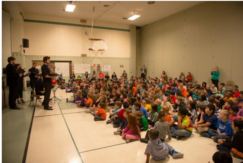
The Mirandola Ensemble, a choral ensemble based in Minneapolis, visited Oak Grove Elementary in Bloomington in October 2014.

Classical MPR's Class Notes: Artists program gives elementary students the opportunity to observe and learn from professional musicians by embedding regional classical music ensembles in local community schools. Musical artists come to schools to offer live, in-school performances and age-appropriate educational presentations. In support of artists' visits, teachers are provided with related curricular materials, and students receive online access to music from the artists who visited their school and other classical artists from Minnesota. In fiscal year 2015, more than 27,500 students in 60 schools across the state experienced a live performance and educational presentation from one of eight Minnesota classical ensembles.