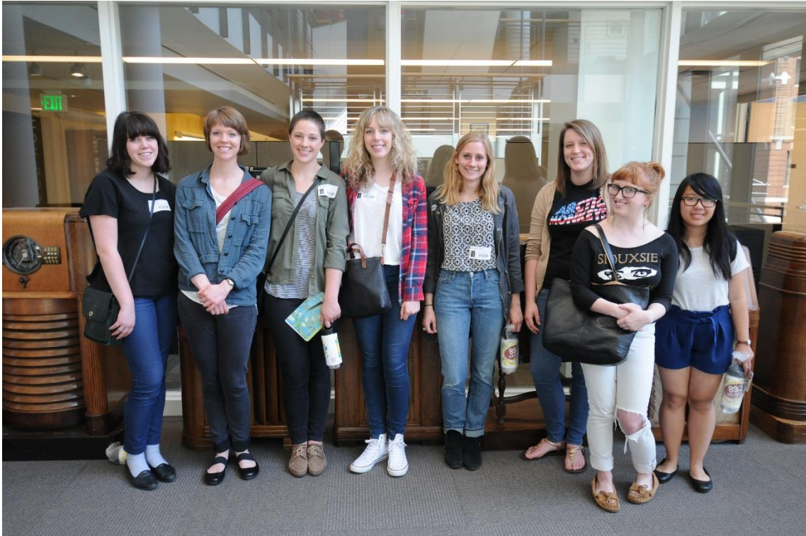
A group of Local Current Blog student writers gathered at MPR in April 2015 for a day-long training session in music journalism.

The Local Current Blog features the writing and photography of students from across Minnesota through the College Contributors program. Students build their journalism skills by working with Local Current Blog writers and editors and attending a day of training in music journalism at MPR. Their contributions offer audiences new perspectives on local music – including campus music news, live events and music scenes from Minneapolis to Morris to Winona. In fiscal year 2015, more than 250 Local Current Blog posts featured work by 30 student writers and photographers, representing a total of nine different Minnesota colleges.