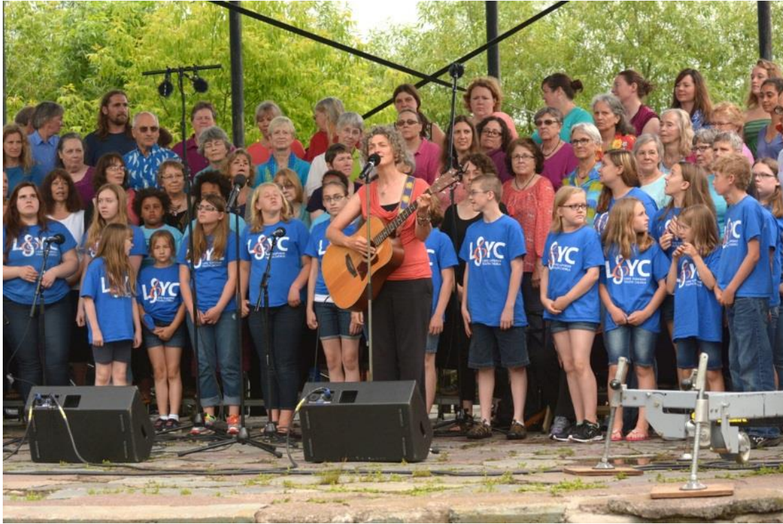
Members of three Duluth choirs take the stage at Harmony in the Park at Leif Erickson Park in June, 2015.

Harmony in the Park enhances Minnesotans' access to live arts experiences through a family-friendly outdoor choral festival series. Free and open to the public, two Harmony in the Park events in fiscal year 2015 convened some of the state's finest choral ensembles to fill summer evenings with song. In total, fiscal year 2015 Harmony in the Park events had more than 2,500 attendees and featured six Minnesota choral ensembles including more than 200 individual singers.