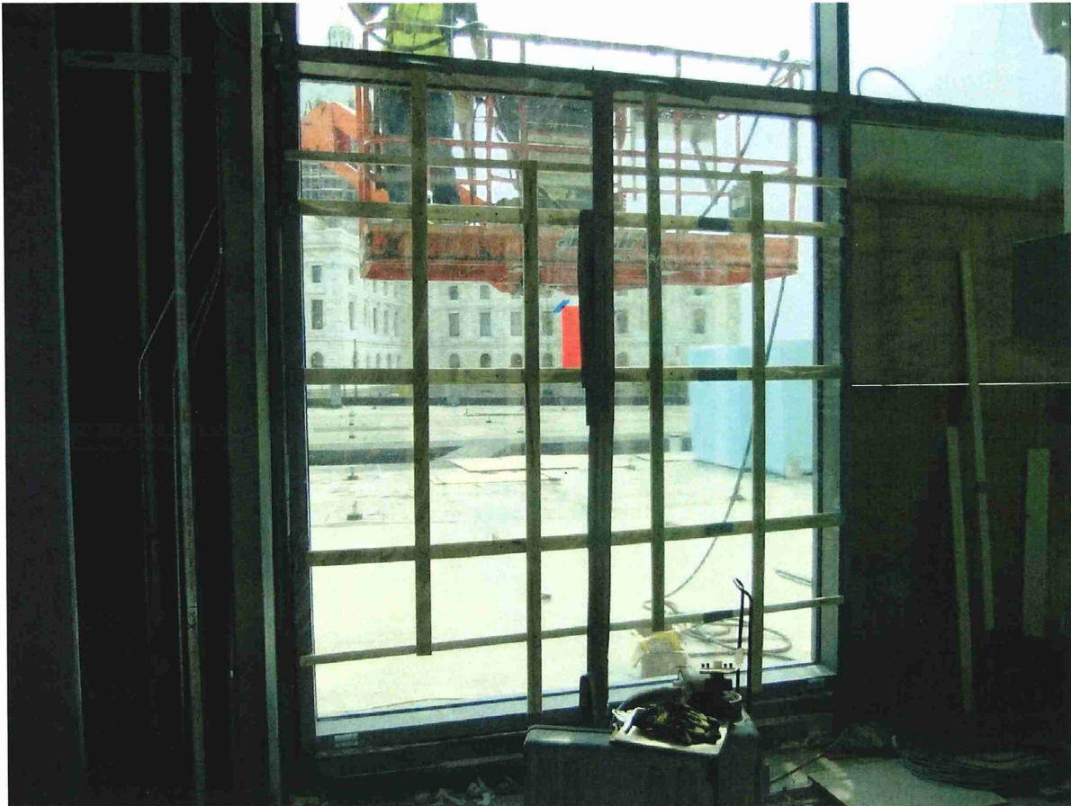
Photo No. 1 - Interior view of test area CW4 performing AAMA 503-14 testing.