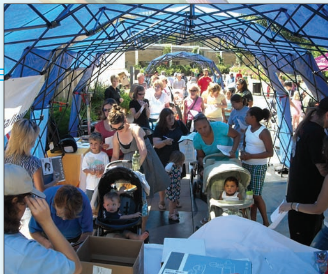
Community events and member safety events provided opportunities to reach families with safety information and tools. Above, we distributed 300 booster seats to families in need.

We promoted our bicycle helmet group purchase program to community groups and public safety organizations. Through an