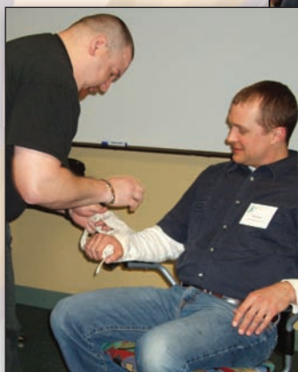
First aid training was increasingly in demand; we also distributed life-saving automated external defibrillators.

Some of our courses helped support safety programs and professional development at the same time. The Basic Safety Certificate was achieved by 65 people. Another 26 completed the Advanced