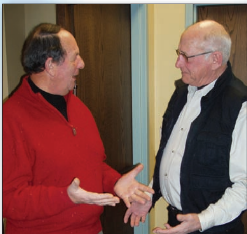
Whether onsite, online or on the phone, our staff provided experienced support, answering questions, identifying issues and developing solutions.