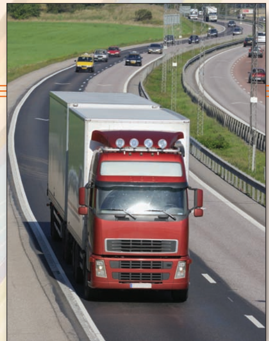
Driver and fleet safety services included commercial vehicles and DOT compliance.

First Aid/CPR/AED training. Our First Aid/CPR/AED training provided life-saving skills and essential support for workplace emergency preparedness plans. Participation in training increased nearly 10 percent over 2009. We offered a variety of National Safety Council courses, including instructor training designed especially for workplace settings. We also distributed customized first aid kits and state-of-the-art Philips automated external defibrillators (AEDs). Nearly 200 certified instructors, based in regional population centers, offered our training statewide.