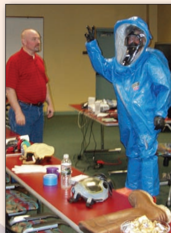
Our training and consultation reached workplaces throughout the state. Above, hands-on learning in an emergency preparedness class.

Employers seeking to conduct their own training most frequently selected video-based programs. The “Train-the Trainer PLUS” series continued to be a popular option, providing video training programs and instruction in how to implement them. We added a new back safety program to