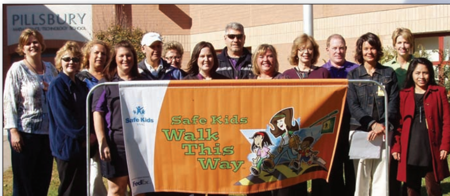
Safe Kids, FedEx and the Minneapolis public schools joined forces to support pedestrian safety at a Safe Kids Walk this Way event on International Walk to School Day.