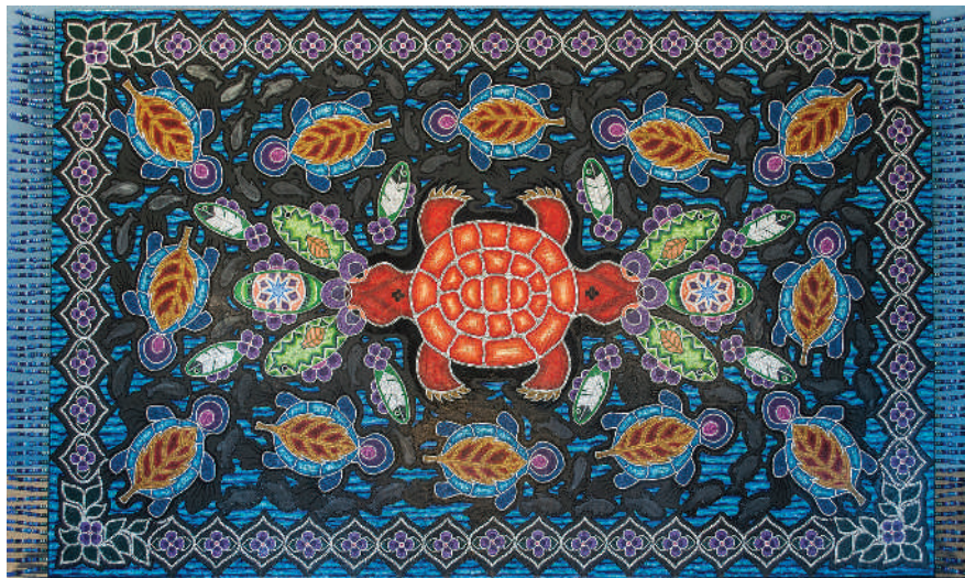
Turtle Dance by Leigh Yellowbird