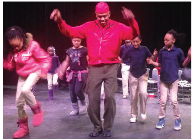
Plymouth Christian Youth Center and Capri Glee .