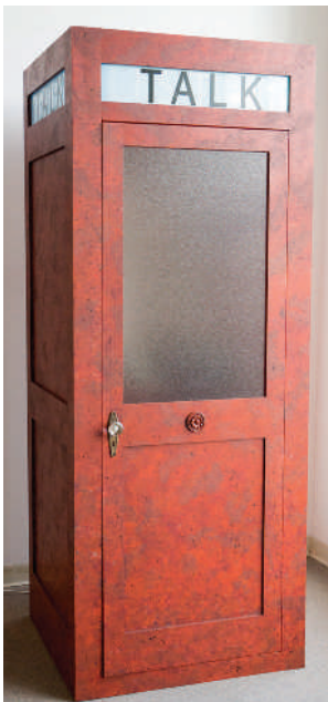
Talk/Listen Phone Booth created for the exhibit What's Left: Lives Touched by Suicide which opened at Grand Rapids' MacRostie Art Center and will tour Minnesota for the next three years.

During fiscal year 2014, the The Arts Board made a partnership grant to the Nonprofits Assistance Fund, Minneapolis, to offer Financial Assessment and Planning for Small Arts Organizations sessions in greater Minnesota communities in five regional arts council areas (1, 4, 5, 6/8, and 9). In fiscal year 2015, the Arts Board again made a grant to the Nonprofits Assistance Fund to conduct similar training sessions in the remaining greater Minnesota regions (2, 3, 7E, 7W, and 10). The training sessions were designed to increase expertise in and capacity for financial management and planning in greater Minnesota's smaller arts organizations.