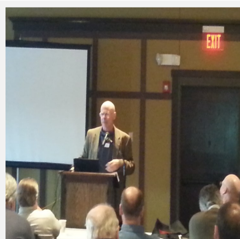
DNR Commissioner Tom Landwehr recognizing the accomplishments of the Mississippi Headwaters Board.