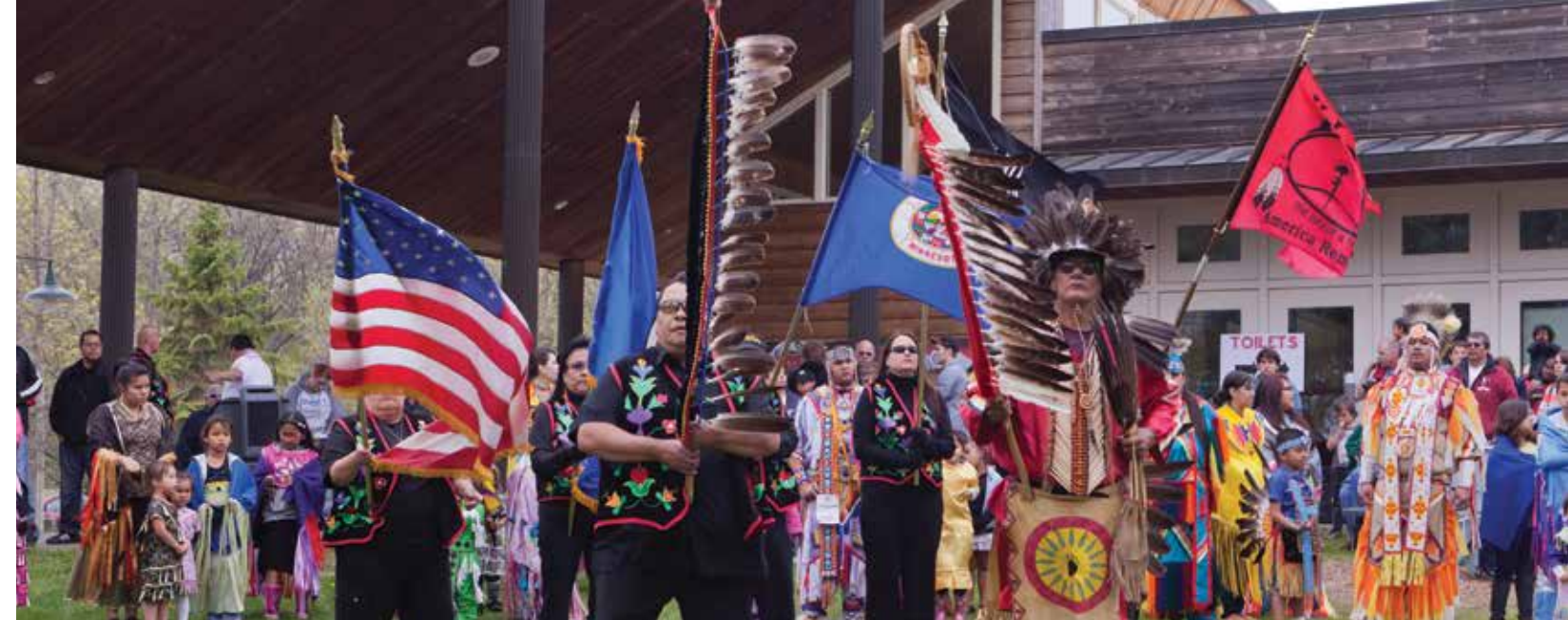
Members of the Mille Lacs Band of Ojibwe participate in the annual powwow at Mille Lacs Indian Museum and Trading Post.

In May, the History Center opened Toys of the '50s, '60s and '70s , a nationally traveling exhibit that draws on nostalgia to capture the craziness, joy, and sheer fun of being a kid. The exhibit has been extraordinarily popular and is on track to break all previous exhibit attendance records.