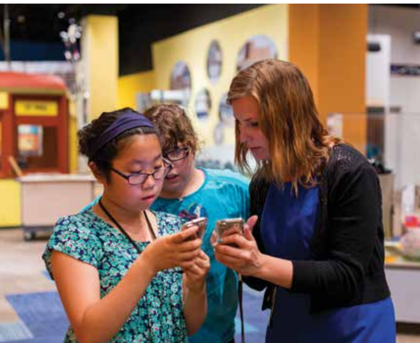
Left: Students using Play the Past . Right: History Player in the Classroom lesson Promise Fulfilled? The Emancipation Proclamation: Past, Present & Predictions .

MNHS worked with a number of partners in FY14, including Step-Up, the City of Minneapolis' summer jobs program for low income youth, which resulted in student interns working at Mill City Museum. And, Points of Light, a national service organization, included MNHS in a new initiative to train organizations to leverage volunteers and their skills to address community needs.