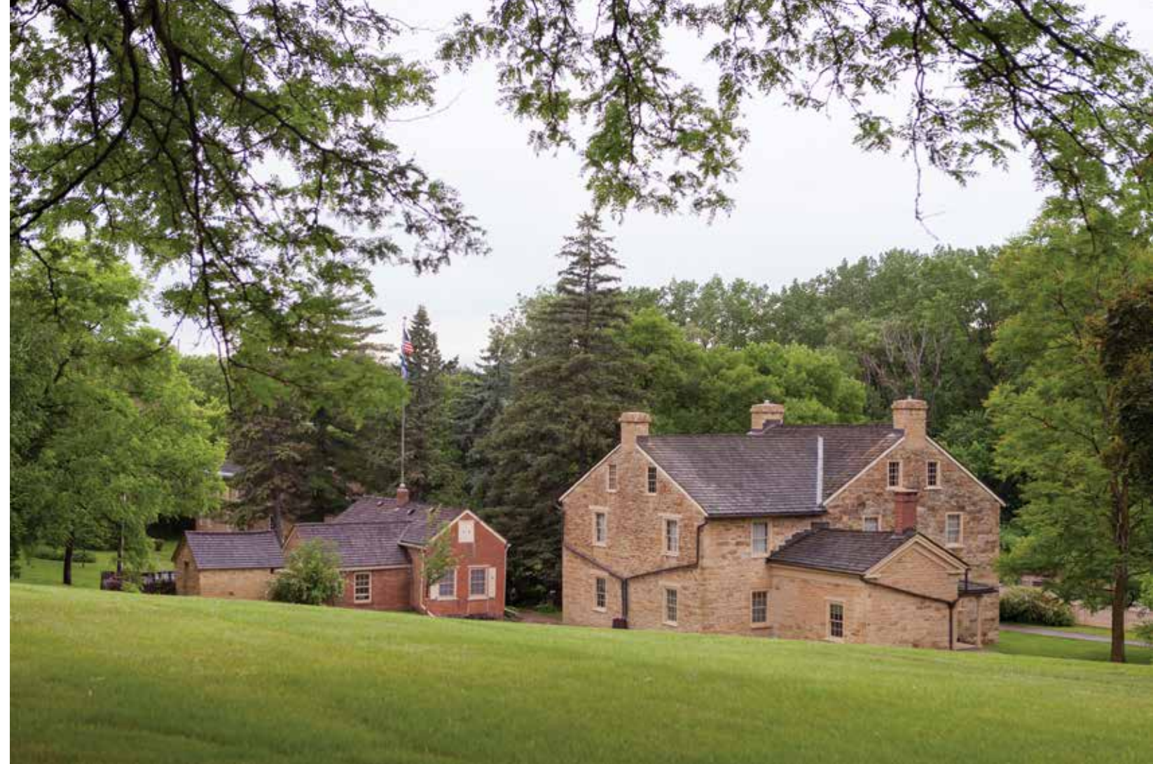
Sibley House Historic Site, one of three historic sites supported by the DeLeo challenge in FY14.