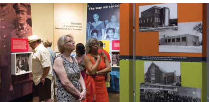
Left: Visitors welcome the story of Rondo in the Then Now Wow exhibit. Right: A young girl enjoys the Toys of '50s, '60s and '70s exhibit.

Building condition assessment reports were completed for the visitor centers at Grand Mound and Historic Fort Snelling, which will help make decisions about improving public access.