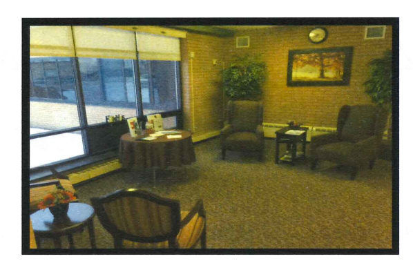
Above: Waiting Area in the New Office Space.

The Northwest Regional Development Commission was created on February 2, 1973 by the joint actions of local units of government. Programs were set up to reflect priority work items of the time, and relationships were established with the state and federal agencies that could provide assistance with local projects. Programs and work priorities have changed in response to economic