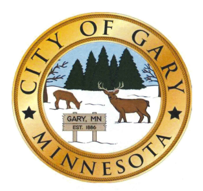
Above: Gary, MN is one of the communities undergoing Comprehensive Planning.

A unique partnership has developed over the past two vears to bring comprehensive planning services to area communities. NWRDC has teamed up with the Northwest Minnesota Foundation (NMF) to assist small communities with planning efforts to help position themselves for the future. The NMF has provided underwriting assistance to communities in order to help pay for planning services provided by NWRDC staff. The communities leverage those dollars by providing matching funds. In this way, small towns with limited budgets and staffing limitations are able to do the planning necessary to provide a blueprint for development and growth. Comprehensive plans are put together through a series of public meetings that engage the community and result in a reasonable and rational basis for development, including land use, economic development, housing, transportation needs, recreational opportunities, infrastructure options and many other "quality of place" issues. The public process is designed to encourage community participation so that residents have an important role in determining their own destiny.