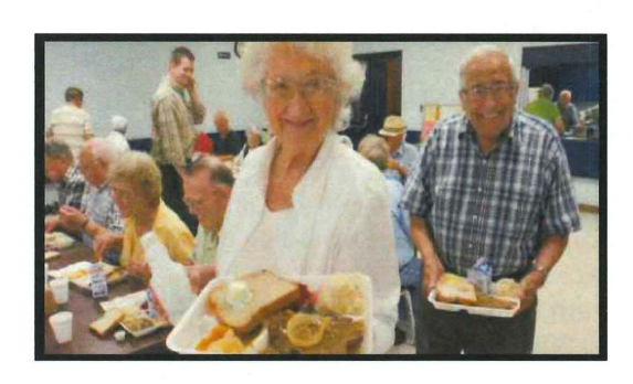
Above: Meals provided to older adults.

Clearwater Senior Transportation - Provided 200 oneway trips to 23 persons.