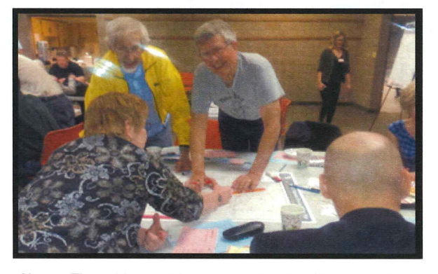
Above: The public provides comments to the State Bike Plan.

Bicycle System Plan will be used to: connect the locally desired places of interest, use the existing routes to plan for future bike routes and help plan future highway design standards. The public is asked to get involved by contacting the NWRDC to provide information on desired bicycle corridors. You can also provide feedback by logging into the MNDOT webpage located at: http://www.dot.state.mn.us/bike.