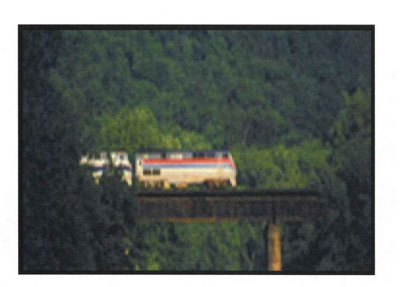
Above: Freight train moving product nationally.

The plan will identify priority rail corridors, programs and projects that offer effective improvements or expansion for passenger and freight travel in and out of Minnesota.