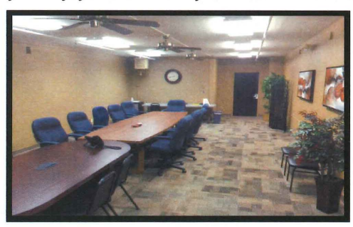
Above: Newly renovated Conference Room.

mapping to assist our own programs as well as local and state clients. Arts Promotion, Loan Fund and Community/Economic Development Programs consistently bring excellent service to the public, including: promotion and development of local artists and cultural activities, providing business loans and technical assistance, and delivering comprehensive planning and infrastructure grantwriting assistance. Added to all these programs are our excellent financial and secretarial staff, who prepare budgets, reports, agendas and many other duties vital to efficient program and agency operation. The NWRDC team looks forward to providing these services and more to the public. We hope you enjoy this summary of activities for 2014.