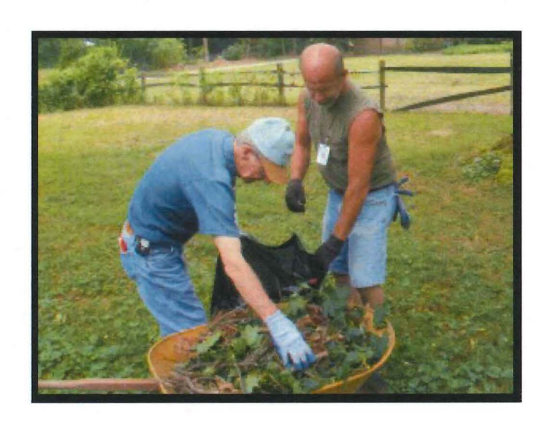
Above: Chore service in progress.

Tri-County Community Corrections Sentence to Service Chore Program - Provided 520 hours of chore service to 133 persons.