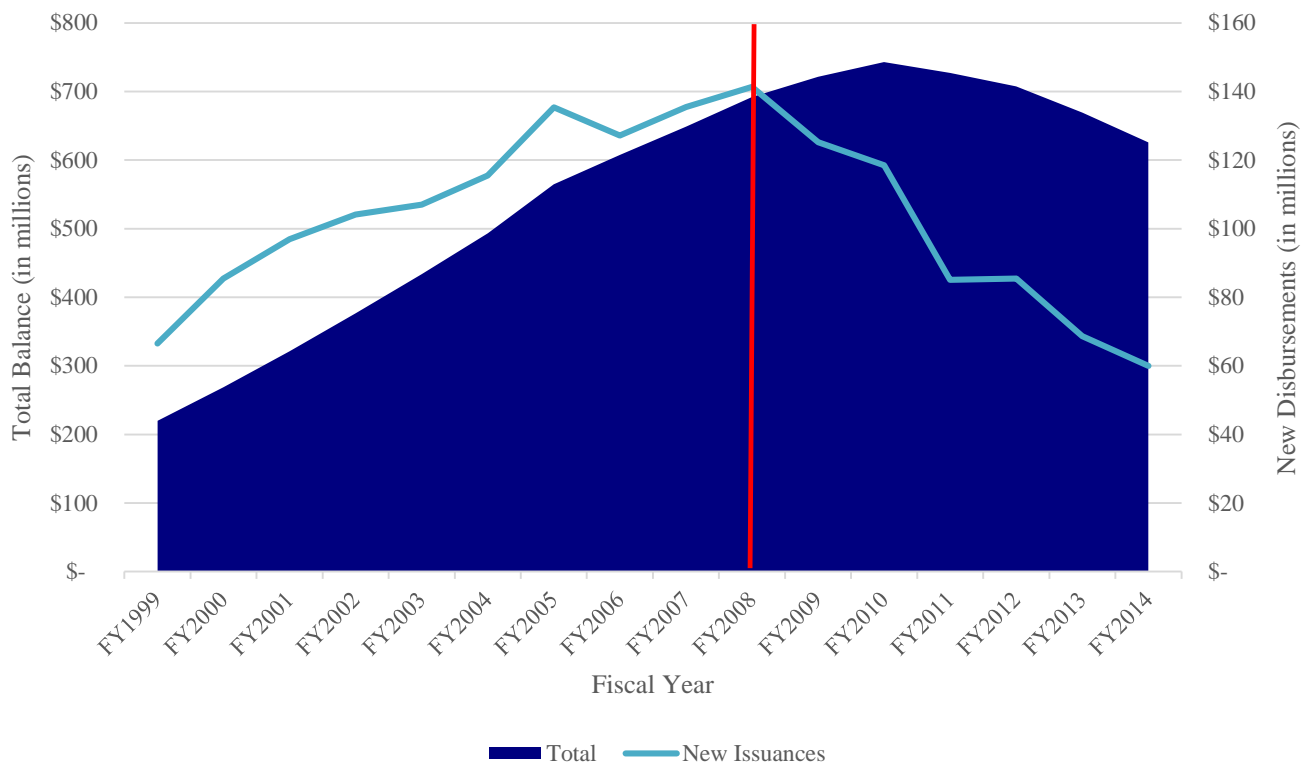
Figure 3: SELF Loan New Disbursements and Total Portfolio Balance, Fiscal Years 1999-2014