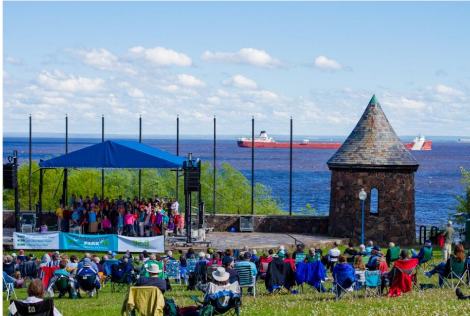
Harmony in the Park was held at Leif Erikson Park in Duluth.

Harmony in the Park is a family-friendly outdoor choral festival series. Free and open to the public, three Harmony in the Park events in 2014 convened some of the state's finest choral ensembles to fill summer evenings with song. In total, 2014 Harmony in the Park events had more than 3,000 attendees and featured nine Minnesota choral ensembles including more than 340 individual singers.