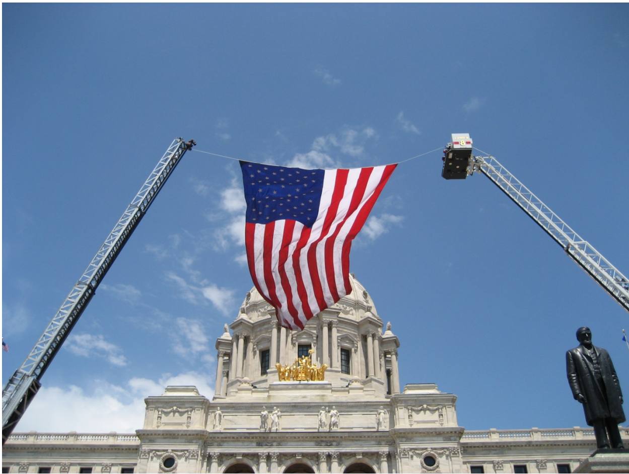
State Capital Building, WWII Dedication.

In the event of unsatisfactory experience, it is possible that no dividend will be declared or a favorable year's dividend will be used to offset the poor experience. This approach creates a more level dividend over time, and also minimizes the possibility of a premium assessment, which can be very disruptive to an agency's budget.