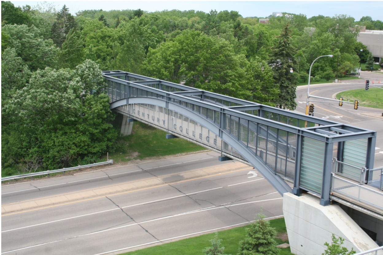
Century College Foot Bridge