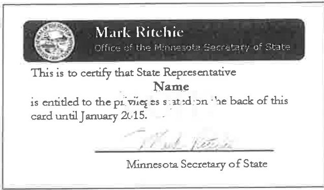
Front of legislative privilege from arrest card