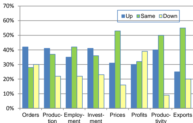
Economic Performance for Minnesota's Manufacturing Industry -- 2013, Compared to 2012

At least 40 percent of manufacturers experienced growth in number of orders, production, investment and productivity. More than 40 percent reported unchanged employment levels and 53 percent indicated the same price levels as in the previous year. Nonetheless, nearly 40 percent of respondents experienced a decrease in profits.