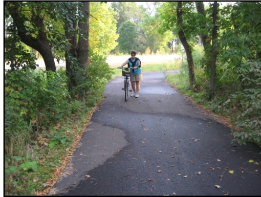
TAP is a new way of funding trails like this one in Jackson County

The Transportation Alternatives Program or TAP is the combination of the former Transportation Enhancements, Scenic Byways, and Safe Routes to School funding categories. In Minnesota, the TAP program is the responsibility of the Area Transportation Partnerships (ATPs). The ATP is a collaboration between the RDCs, MN/DOT and local units of government in the region. The SRDC provides staff support to the ATPs in MN/DOT Districts 7 and 8.