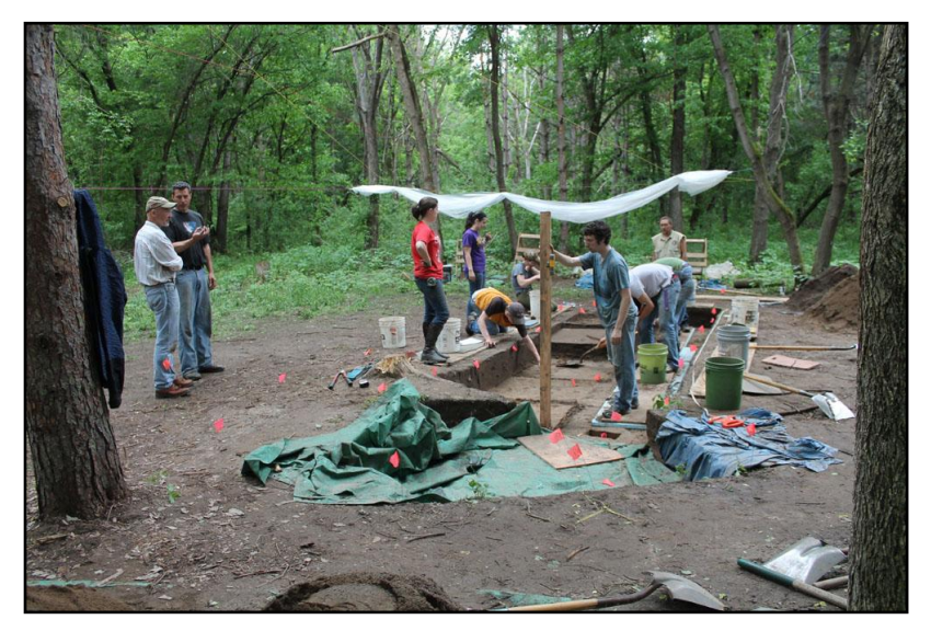
Minnesota State University – Mankato field school in Goodhue County (21GD260)

Community College also offer courses in archaeology with some fieldwork. The University of Minnesota, St, Cloud, and Mankato offer graduate programs in archaeology, with only the University of Minnesota-Minneapolis offering a PhD track in archaeology. In FY 2013, the following university-based field research was undertaken in Minnesota: