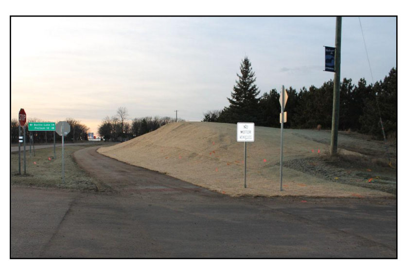
Damaged area of 21OT13 after restoration.

The State Archaeologist returned to the site on 10/11/12 and confirmed that the slope had been stabilized and the trail was once more under construction. Heavy clay soil had been placed on the slope and grass matting laid down to prevent erosion. The State Archaeologist visited the site again on 11/20/12 to photograph the area after completion of construction.