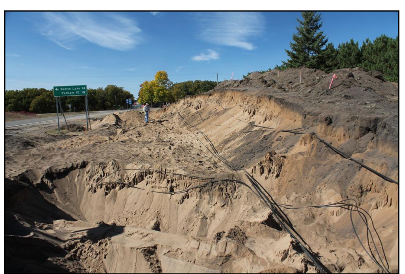
OSA's Bruce Koenen examines the grading damage to 21OT13 in Otter Tail County.

On 9/24/12, a MnDOT archaeologist contacted the State Archaeologist about a report of bones being found by the trail construction. The State Archaeologist informed MnDOT to tell the contractors to immediately halt all construction. OSA personnel visited the site the next day and noted that the backslope cuts from the trail construction had extended into Mound 18 and the area noted as containing early historic Ojibwe graves. Human remains as well as what