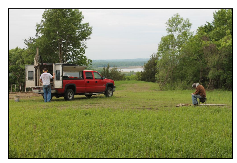
Strata Morph personnel doing mechanical soil coring at 21HE20.

still 15 visible mounds: 1, 8, 9, 14, 15, 21, 22, 30, 31, 40, 41, 42, 43, 47, and 48.