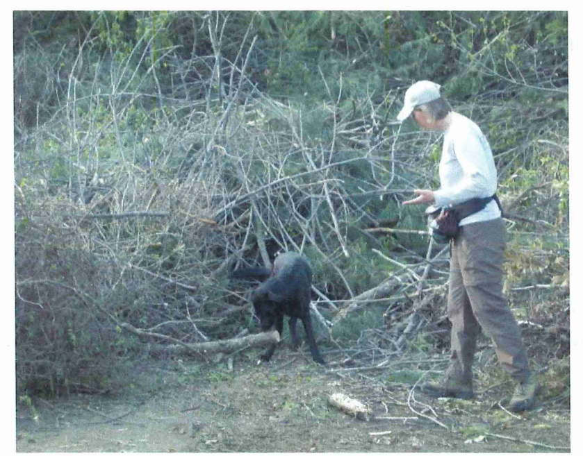
Figure 4. Typical brush pile after resident has deposited load, but before county pushes brush up into tall mound. Here Wicket shows that despite being surrounded by leaves, twigs, and bark, she preferentially targets the cut end of a branch before alerting.