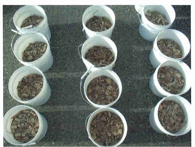
Figure 1. Mulch buckets ready for level 1 proficiency evaluation

We note here that "total number of correct responses" means the dog indicates correctly that a target is present. As a testing scenario we created a circle or line-up of 15 two-gallon buckets each containing either target or non-target mulch (see Figure 1). The dog would be directed to sniff each bucket and was expected to ignore non-target mulch and indicate (by sitting or downing next to the bucket) to those buckets containing