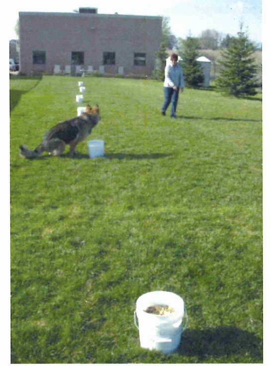
Figure 2. During proficiency level 1 trials dogs encountered buckets either in a line or circle, sniffed each bucket, then indicated the presence of a target (demonstrated here by Denali, who is sitting at a target bucket) or ignore non-target mulch.

commitments and so did not have the opportunity to re-test. The fifth dog (Tia) began the project once we had