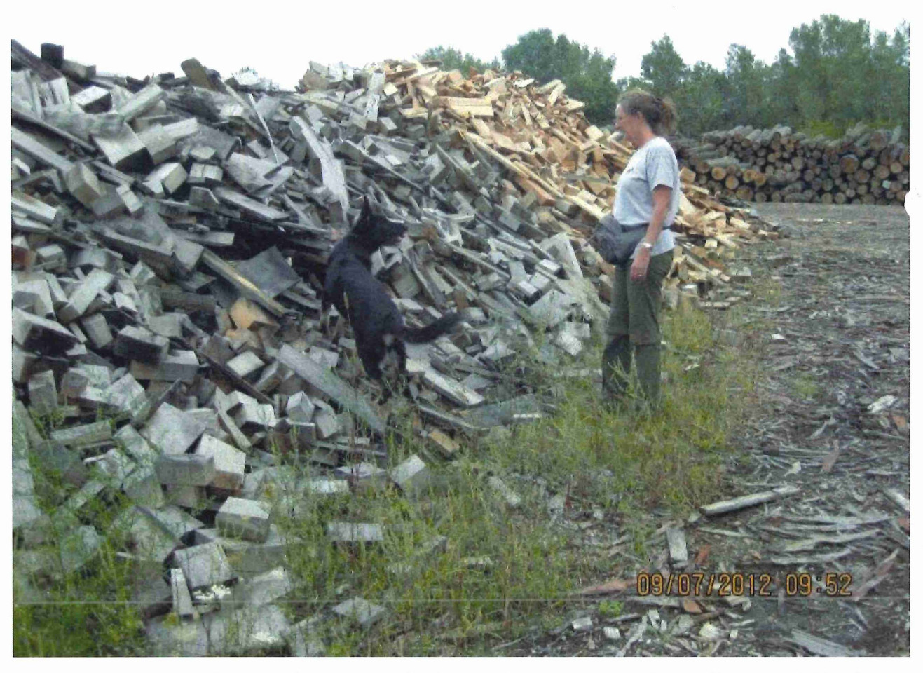
Figure 5. Dogs encountered some firewood piles. Because pile size, wood types, and age of firewood are so variable, it's vital to be exposed to numerous examples during training.

Logs in firewood piles appear to be a viable application, although we worked much less with this application than logs in brush piles. Properly training a dog for this task should involve more weathered wood, and split wood than we had access to during this project (see Figure 5). Logs on or near the surface would be most likely to be detected.