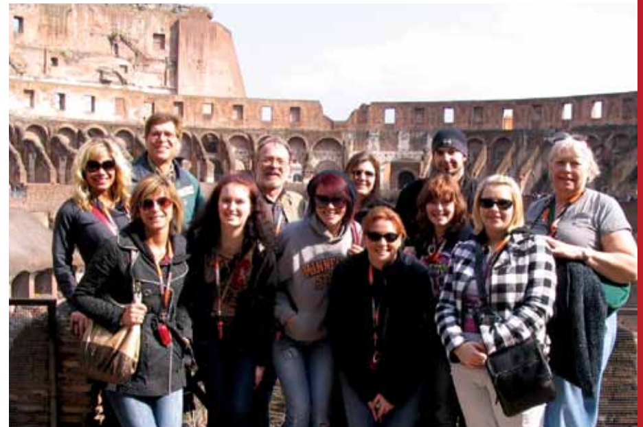
Above, an Italian Renaissance travel studies group gathers inside the Colosseum in Rome.

Exciting study abroad opportunities in Europe, Asia, Africa and other parts of the world are available to Minnesota State Colleges and Universities students. You can participate in short study trips or spend a full semester abroad. Programs range from language and cultural studies to service learning projects that help local people and communities. Ask for study abroad information from the college or university you are interested in attending.