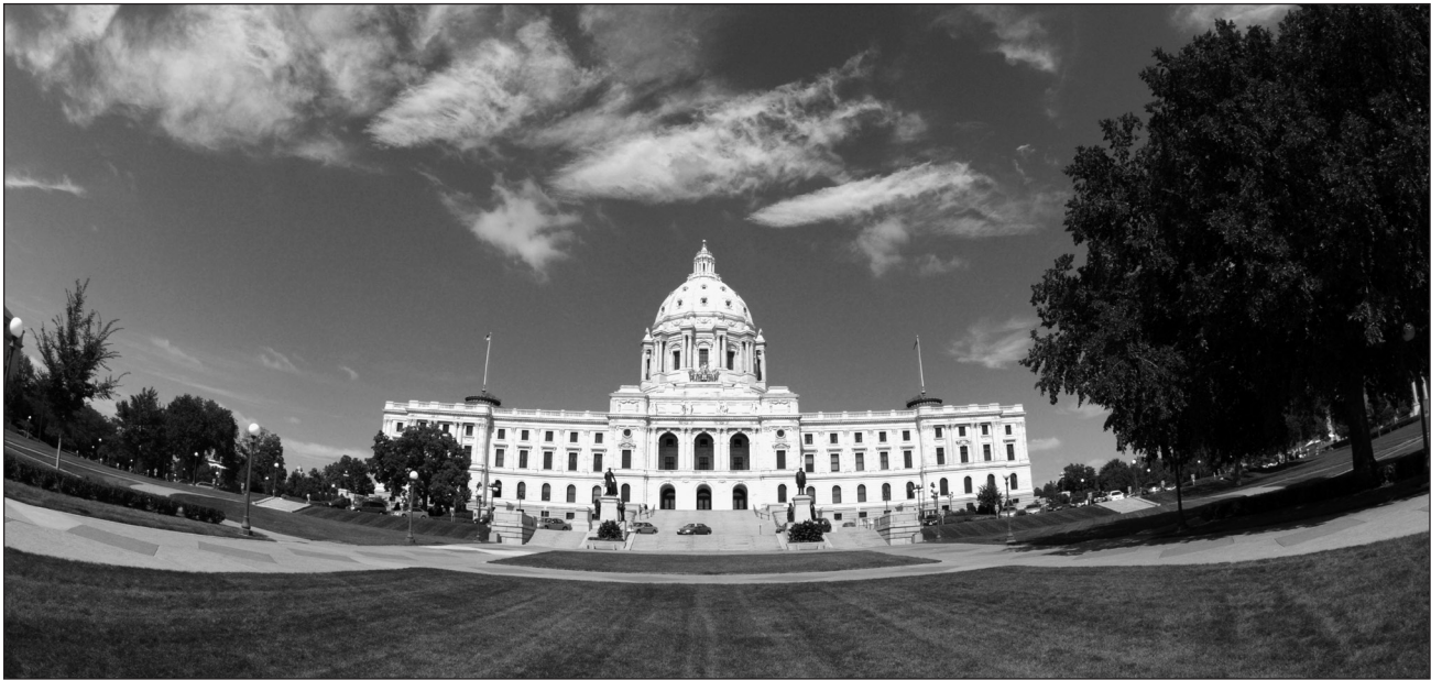
The Minnesota State Capitol.

Conciliation courts hear civil disputes up to $10,000. However, disputes over consumer credit transactions must be less than $4,000 to be heard in conciliation court.