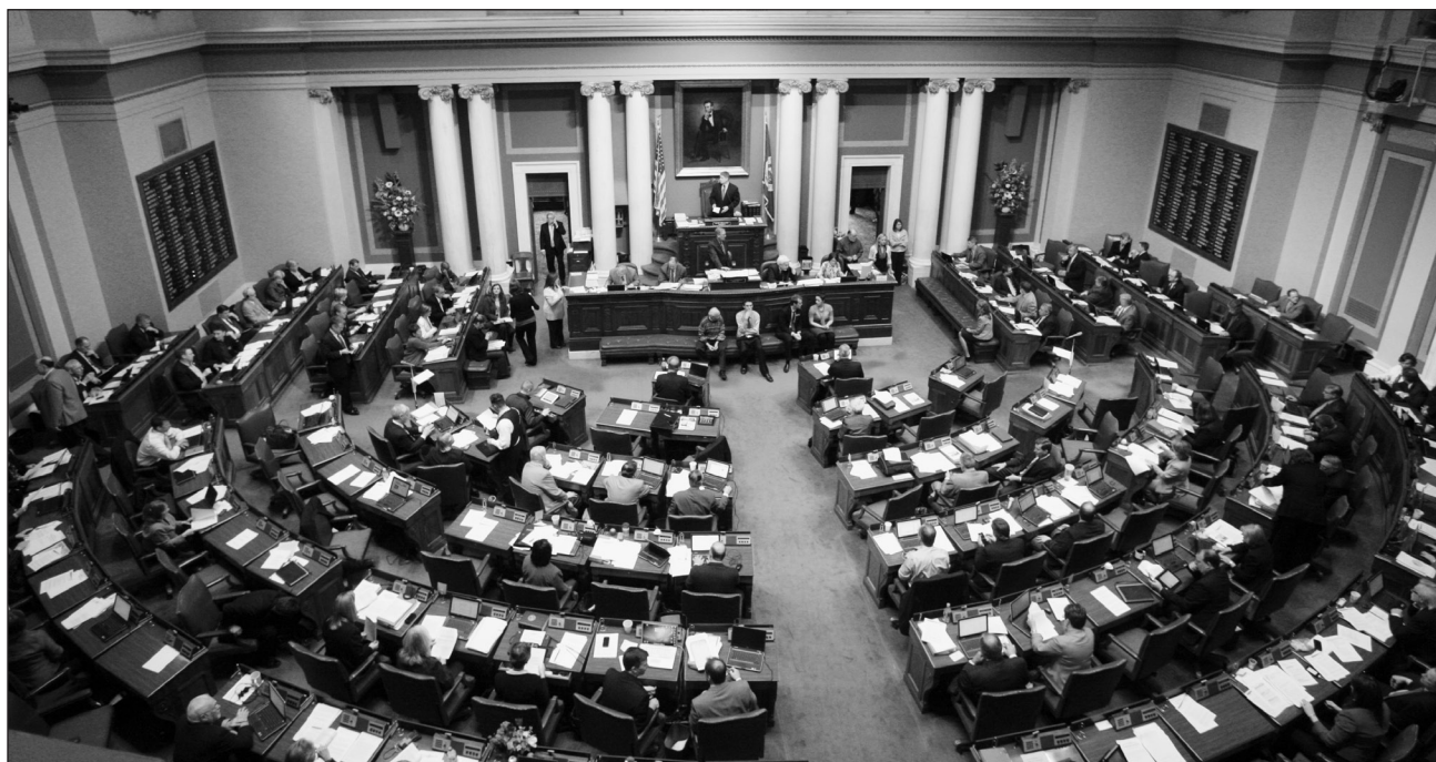
The House Chamber.

The guidelines for procedure of the House session come from six sources: the Minnesota Constitution, the Permanent Rules of the House, the joint rules of the Senate and House, custom and usage, Minnesota Statutes and Mason's Manual of Legislative Procedure. The most complete outline of House procedures is contained in the Permanent Rules of the House, which includes the order of daily business, guidelines for debate and decorum, precedence of motions and voting procedures. After final adoption, copies of the rules are provided to each member and are made available from the Chief Clerk's Office.