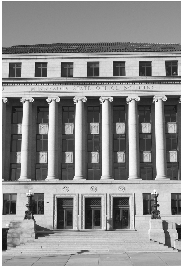
The State Office Building.

To surrender the floor temporarily to another member for the purpose of hearing a question or to hear an explanation.