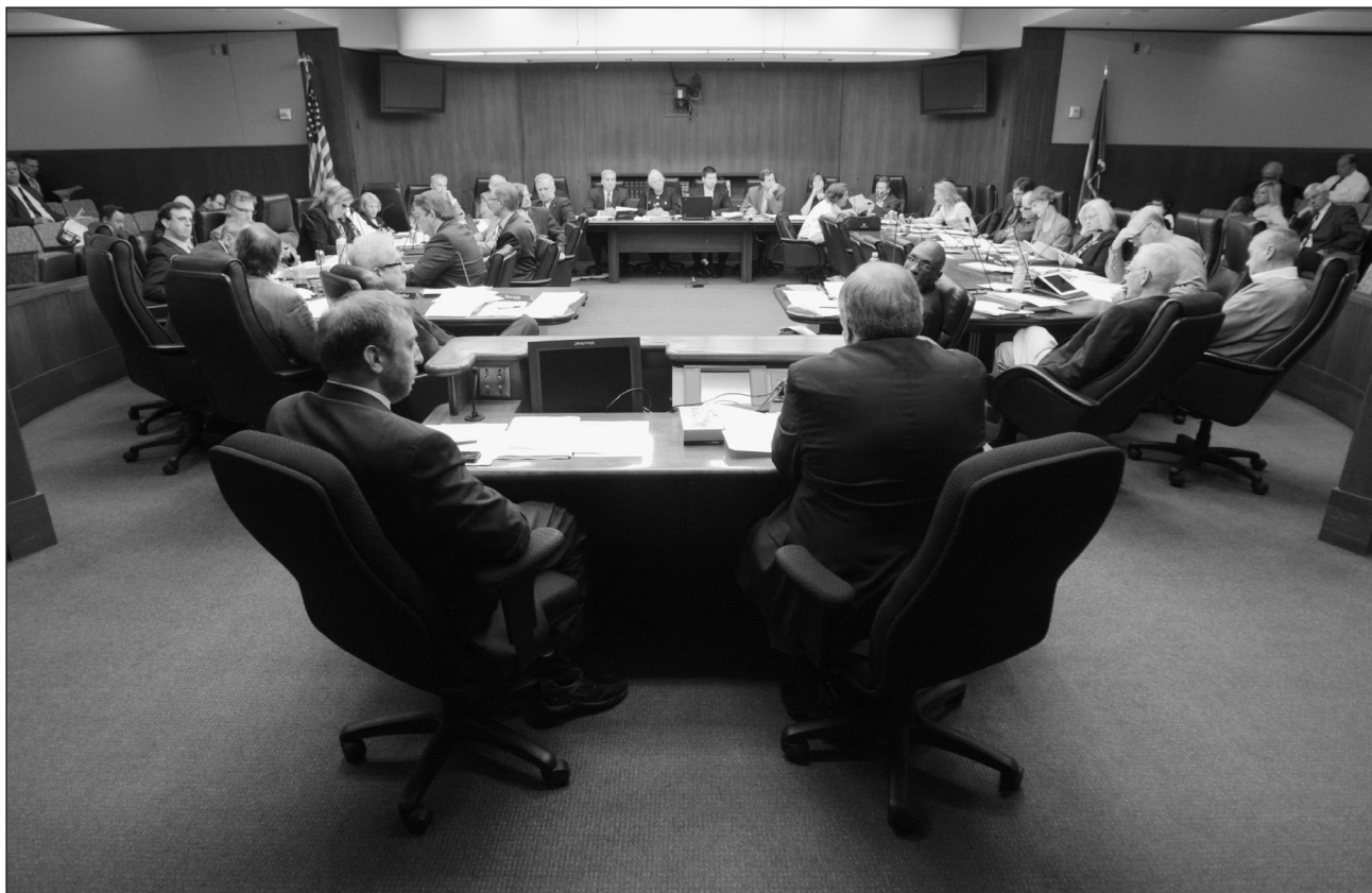
House Ways and Means Committee.

In the second year of the legislative session, the tax committee and finance committees consider adjustments to the budget adopted for the biennium. In the case where there is a projected balance for the biennium, those adjustments may include spending increases and tax reductions. In the case where there is a projected deficit for the biennium, those adjustments may include spending reductions and tax increases. The ways and means committee may adopt another budget resolution to provide direction for those adjustments.