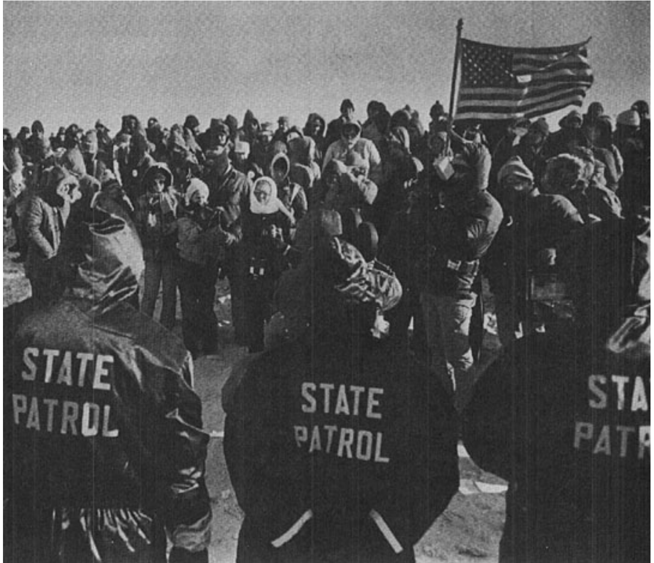
POWERLINE PROJECT PROTESTERS AND THE STATE PATROL