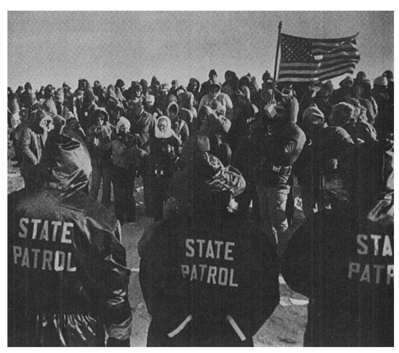
POWERLINE PROJECT PROTESTERS AND THE STATE PATROL