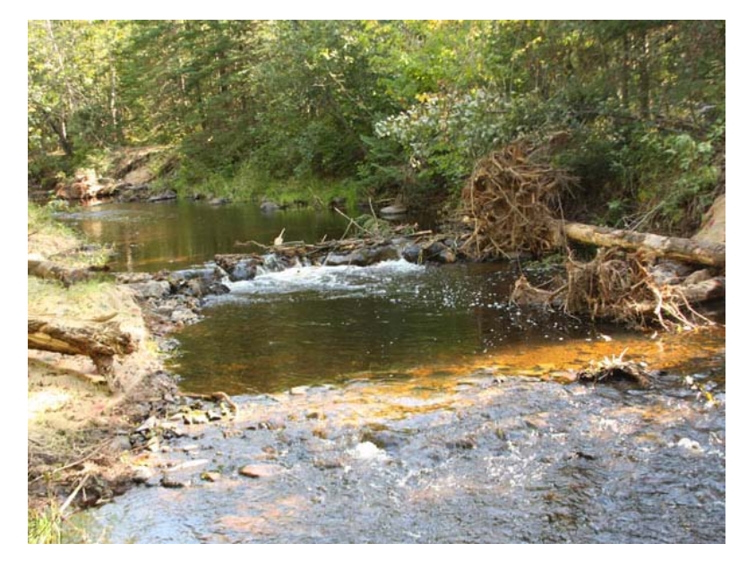
completed rock weir on the Sucker River in St. Louis County