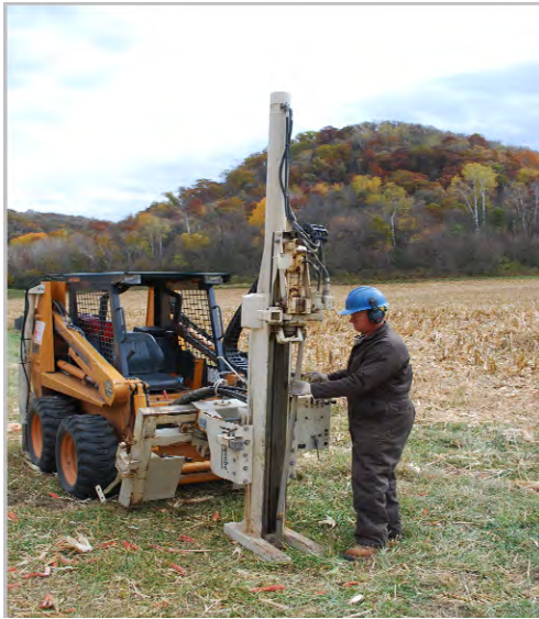
Sampling with a Geoprobe at Geislers Landfill, Winona County

General obligation bonds are used to fund capital improvements, including the construction of remedial systems and the acquisition of land, at publicly owned CLP sites. Since 1994, the Minnesota Legislature has made a number of authorizations of general obligation bonds for these activities at closed landfills, including an initial authorization of $90 million in 1994. The 1994 authorization was intended to be available long term to meet the future capital needs of the program. However, in 2000, Minn. Stat. § 16A.642 cancelled all unused bonds more than four years old, regardless of program need or legislative intent. As a result, nearly $56 million of the original $90 million was cancelled. All authorizations through FY 2012, together with the cancellations, have resulted in a net authorization of over $104 million of bonds for use at closed landfills. Through FY 2012, more than $91 million of general obligation bonds has been spent on construction activities and land acquisitions at 52 sites.