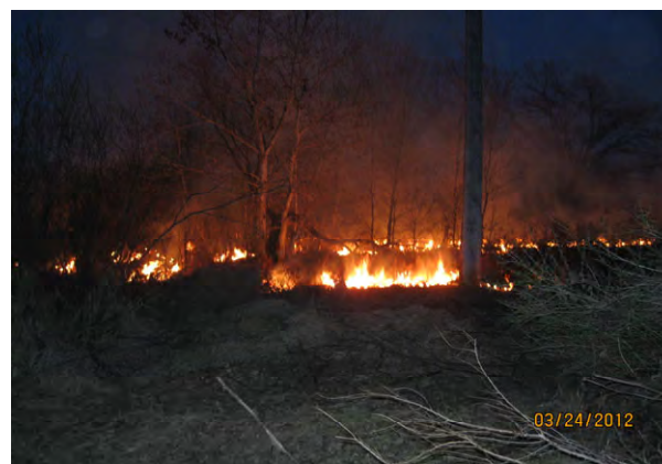
Burning the Oak Savannah at Anoka-Ramsey Landfill, Anoka County

In FY 2012, over 28 million pounds of methane were destroyed by the gas-extraction systems at CLP landfills (see Table 6). This is a significant increase over the FY 2011 total, and is due primarily to the installation of new flares at the WLSSD and Washington County landfills. Since 2000, these systems have prevented about 314 million pounds of methane (2.99 million metric tons of carbon dioxide equivalents) from entering the atmosphere. Stack test results from recent studies show about 99.9 percent destruction of methane and other contaminants in the CLP’s enclosed flares.