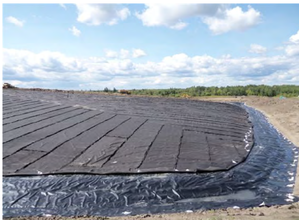
Liner Drainage Layer Installation at Koochiching County Landfill

Site information that is collected is evaluated to help ascertain risks at each site. Minn. Stat. § 115B.40, subd. 2 requires the MPCA to establish and update a priority list for preventing or responding to releases of hazardous substances, pollutants and contaminants or decomposition gases at closed landfills. The CLP uses a scoring model to determine risk at each site. Landfills are scored based on hazards present at each site (monitoring data and field observations), the conditions that exacerbate those hazards (example: subsurface conditions), and the likelihood the public will be exposed to those hazards (distance to wells and buildings, population density). Landfills with high risk scores receive a high ranking or priority.