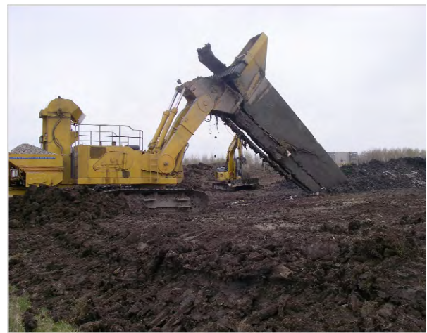
Trenching for Leachate Drain at Koochiching County Landfill

As risks at landfills are better understood or are mitigated over time, the CLP realizes that some of the land it has certain responsibilities on (through easements, restrictive covenants, Landfill Cleanup Agreements) isn't critical to meet its obligations. At the same time, local governments sometimes have desires for certain land uses on those same properties. When situations like these arise, the CLP will consider reducing some of the land it is responsible for. The CLP has authority to do this under Minn. Stat. § 115B.412, subd. 8. Although no such reductions occurred in FY 2012, the CLP is working on reducing some of the acreage at several landfills it is responsible for.