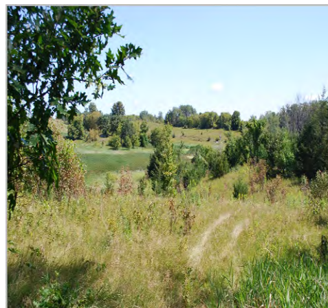
Landfill Buffer at French Lake Landfill, Wright County

In FY 2012, the CLP piloted a project where CLP staff took over the O&M activities that had previously been performed by state active remediation contractors. The purpose was to evaluate whether some of the CLP's O&M work could be completed more effectively and at a lower cost if performed by CLP staff. The landfills chosen for this pilot included Cook County, Dakhue, Kummer, and Mille Lacs County landfills, and to a lesser extent, Northeast Ottertail and Isanti-Chisago landfills. The pilot study resulted in a savings to the state of almost $139,000. The CLP's business plan for O&M takeover estimates a possible savings of about $275,000 in FY 2013.