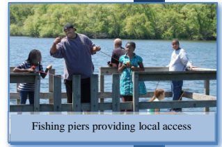
Fishing piers providing local access

FY10 Funds Expended/Encumbered as of 12/31/2011: $8,071,767 FY11 Funds Expended/Encumbered as of 12/31/2011: $7,491,518