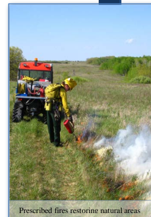
Prescribed fires restore natural areas