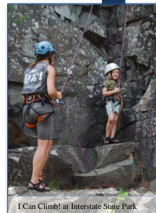
I Can Climb! at Interstate State Park