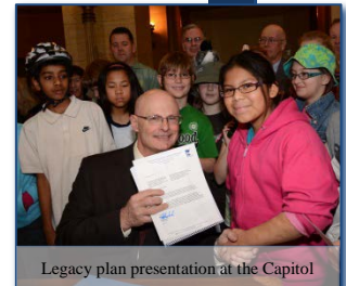
Legacy plan presentation at the Capitol