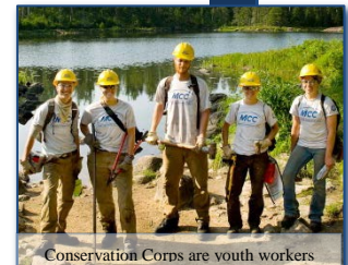
Conservation Corps are youth workers