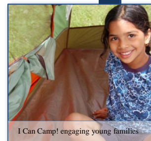
I Can Camp! engaging young families