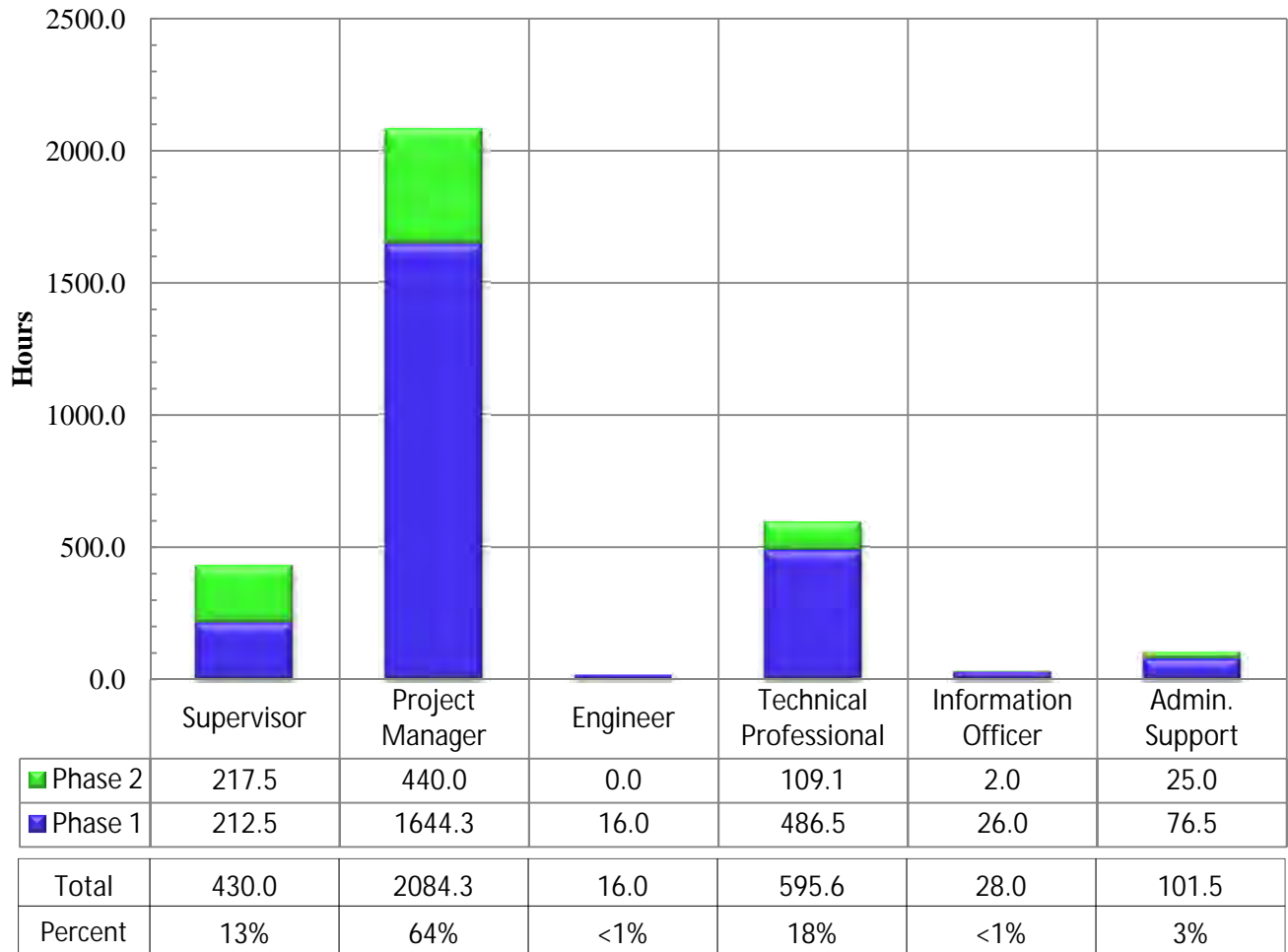
Figure 2. Distribution of staff hours spent on EAWs by position