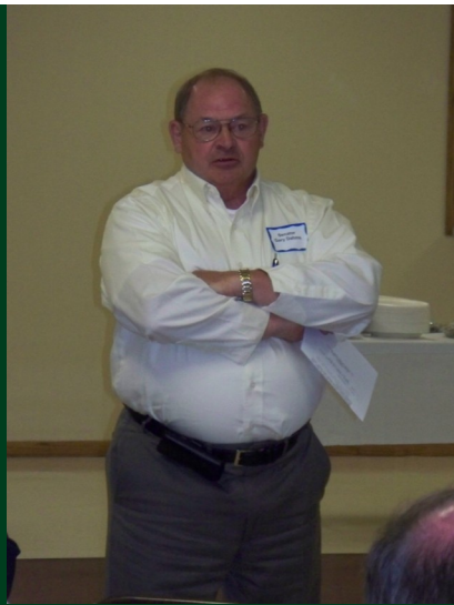
District 21 Senator Gary Dahms