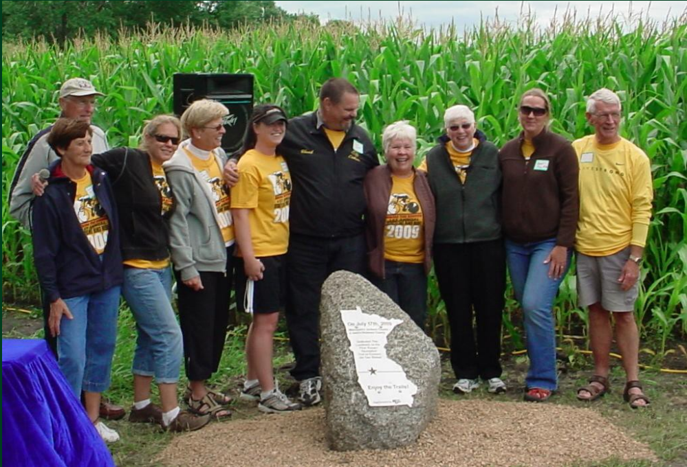
The Friends of the Jackson County Trails and others gather to celebrate the opening of the Des Moines River Trail in Jackson County

The Southwest Minnesota Regional Trails Plan Update http://swrdc.org/planning/transportation.aspx confirmed the vision of the original 2000 Plan: to establish a network of trails in Southwest Minnesota for multiple users. This Plan examines alternative non-motorized transportation modes, primarily walking and bicycling, and recommends actions to improve access and mobility for bicyclists and pedestrians; and has developed a methodology for regional prioritization of projects requesting funding in various phases of trail planning through design and construction. This plan is an element of the Regional Long Range Transportation Plan.