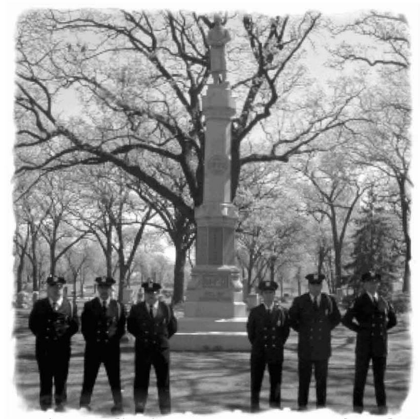
Minneapolis Fire Department Honor Guard