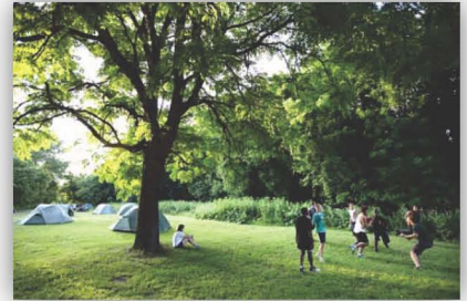
Youth camping program

The program as it currently exists provides for summer camping only. Spring, fall and winter use may be allowed at the discretion of the park manager. Any winter camping would necessarily be "primitive" (with minimal amenities), since water and sewer facilities are not available on Picnic Island in winter.