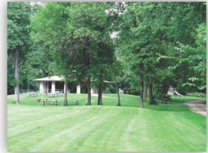
Main picnic area and shelter

In 2008 park staff began a pilot program, Kids at the Confluence. The pilot program is part of the Department’s Gateway Initiative, which seeks to get more people, especially youth and young adults, engaged with the outdoors and stem the decline in outdoor recreation participation by the “Next Generation.” The program’s purpose is: To foster an appreciation of the natural world in young people by providing skill building recreational