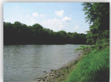
Riverbank at water access