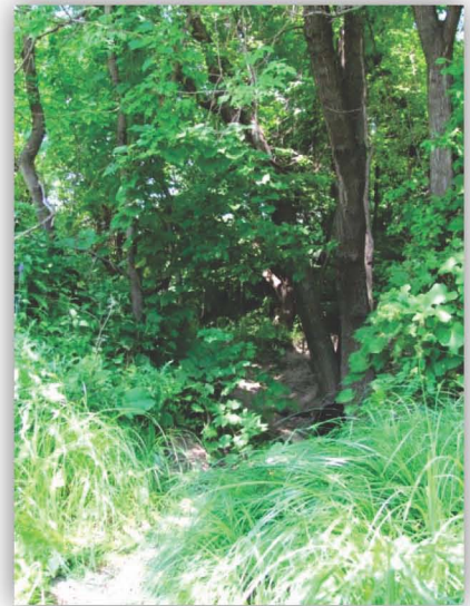
Water access trail site