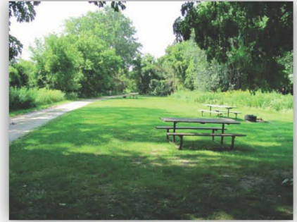
Existing Causeway picnic area