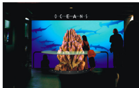
View of theater entrance.