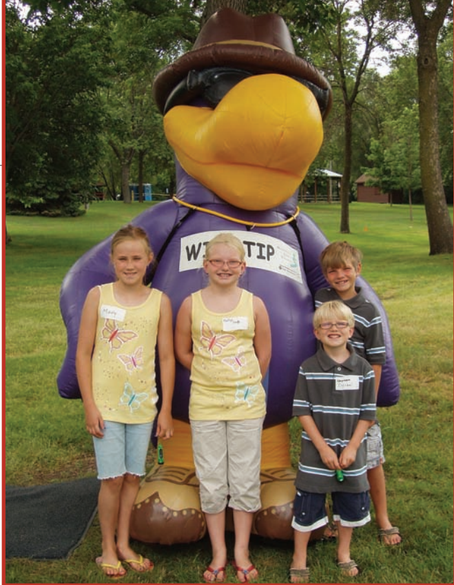
Community and member events reached more than 12,000 people. Left, Wingtip, mascot of our child safety Web site, www.safe-a-rooni.org , took children under his wing at the Andersen Summer Safety Safari, part of the Andersen Corporation's annual employee picnic.

it for 25 years, we helped the railroad safety program transition to independent not-for-profit status in 2008. We will continue to provide active support through service on the MNOL, Inc., executive committee and other activities.