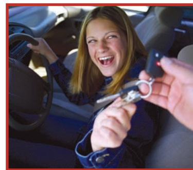
Teen drivers were the focus of "Live to Drive Another Day," a television- and Web-based effort named "Outstanding Chapter Community Safety Campaign" by the National Safety Council.

Through these events and other community and member health and safety fairs, we reached more than 12,000 adults and children with information about making safer choices in order to avoid injury. Tens of thousands more gained information on the interactive children's Web site, www.safe-a-rooni.org , and on www.minnesotasafetycouncil.org .